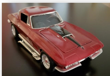
1/25 scale model, built by the author in late 1989