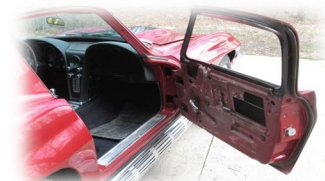
Flaws? What flaws? Nothing to see here!