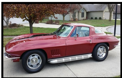
Home in the driveway, after changing repro bolt-on wheels to real rally wheels

It's my understanding that very few (if any) other Corvettes have achieved these awards simultaneously at one convention. I guess I found a good car indeed!