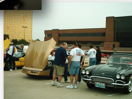
Author's gold 1986 at the Heart of America Regional, 2003