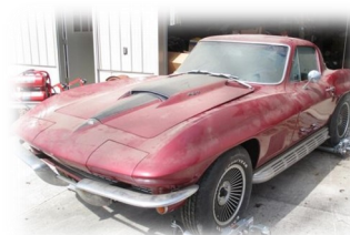
First daylight exposure in many years