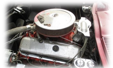
Two of the more obvious areas which needed attention