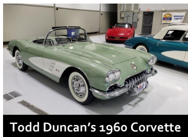
Todd Duncan's 1960 Corvette