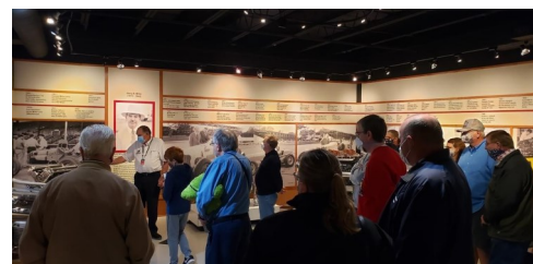
Speedway Museum of American Speed