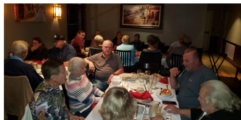
Thursday evening Welcome Reception Supper