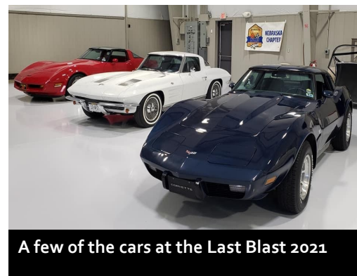
A few of the cars at the Last Blast 2021