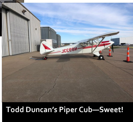
Todd Duncan's Piper Cub—Sweet!