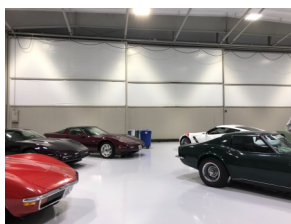
Pre-Event Setup—Nice Cars!!