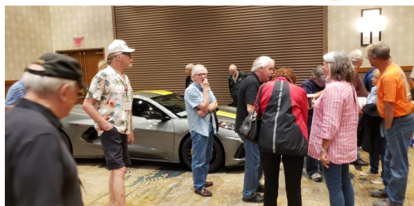
Having some fun before the Group Pic!