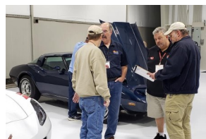
Going over Judging Sheets