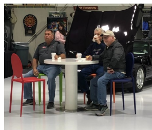
The Guys paying super close attention