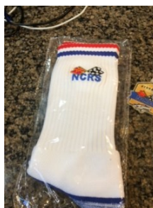
Those Socks—everyone wants a pair