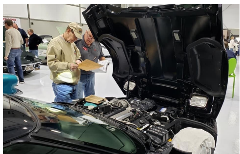
Judging has started