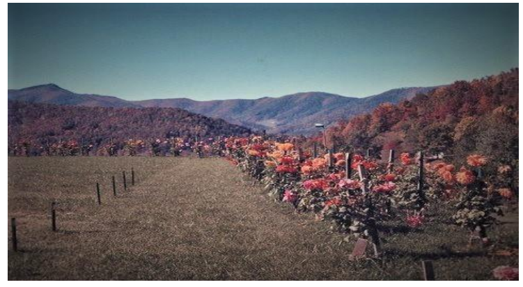
Dahliadel in the Mountains Circa 1970