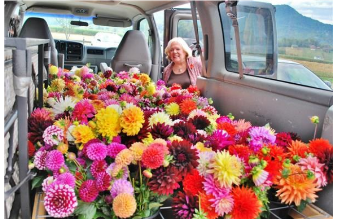
Loaded and ready for market in Asheville!