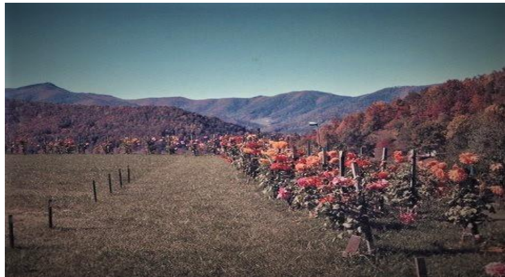
Dahliadel in the Mountains Circa 1970