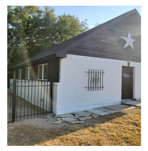
THE PATIO/STORAGE NTheKnowCraes4u Headquarters