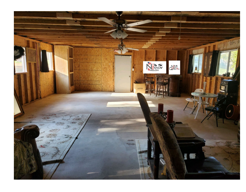
BACK DOOR PATIO ENTRY NTheKnowCraes4u Headquarters