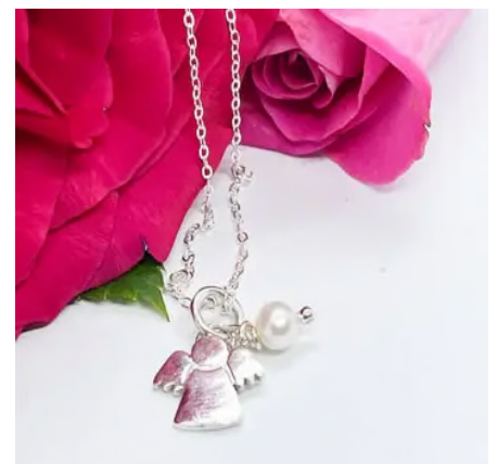
Angel Pendant with Pearl

Each purchase becomes both a keepsake and a contribution: an ornament with a purpose. Pieces range from pendants and earrings to limited-edition brooches, all beautifully presented with heritage-themed packaging and available worldwide through the Baltersan Castle Website: Lady Row Collection – Baltersan 1584 To wear something from the Lady Row Collection is to carry a fragment of that story — a small gleam of Ayrshire history reborn.