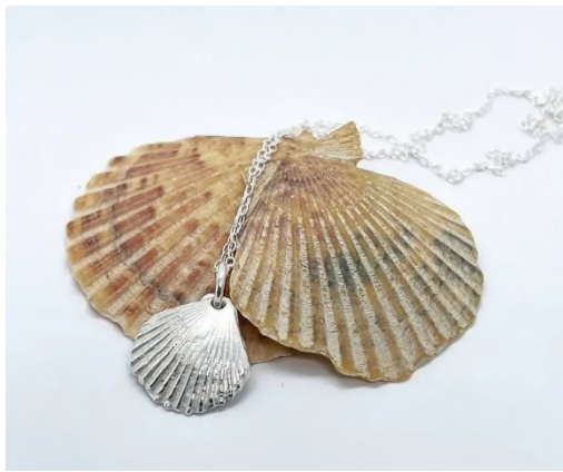
Scallop Pendant (Matching earrings also available)