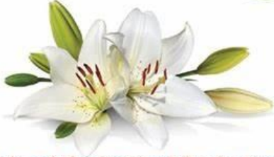
Memorials and Thanksgiving Lilies for Easter Sunday

Below you will find a form to use when ordering your Easter Lilies for the Altar on Easter Sunday. Please include your check made payable to Immanuel Union Church with your order; and send it along to 693 Jewett Avenue, Staten