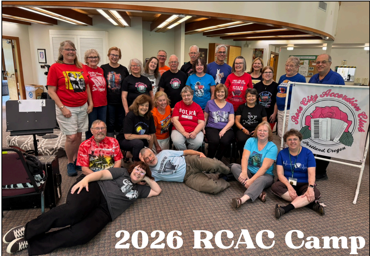
Not everyone, but most of the group.