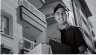
Image Capture at 0.1 Lux with IR LED.