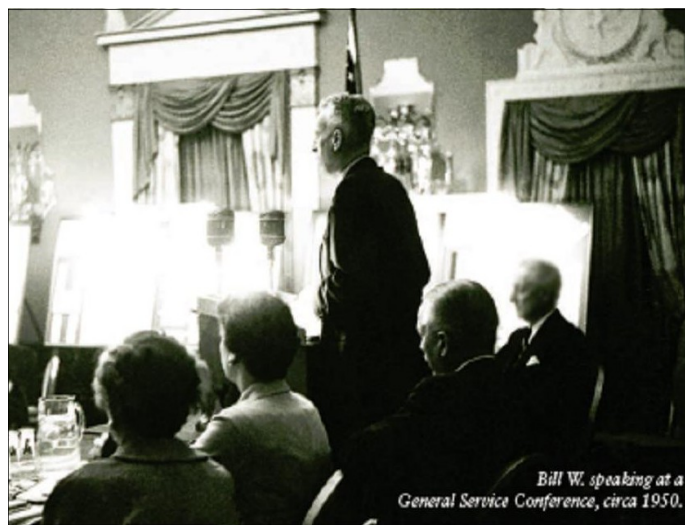
Bill W. speaking at a General Service Conference, circa 1950.