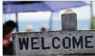
CREATED JANUARY 24TH, 2017