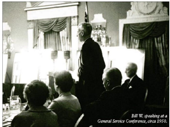
Bill W. speaking at a General Service Conference, circa 1950.