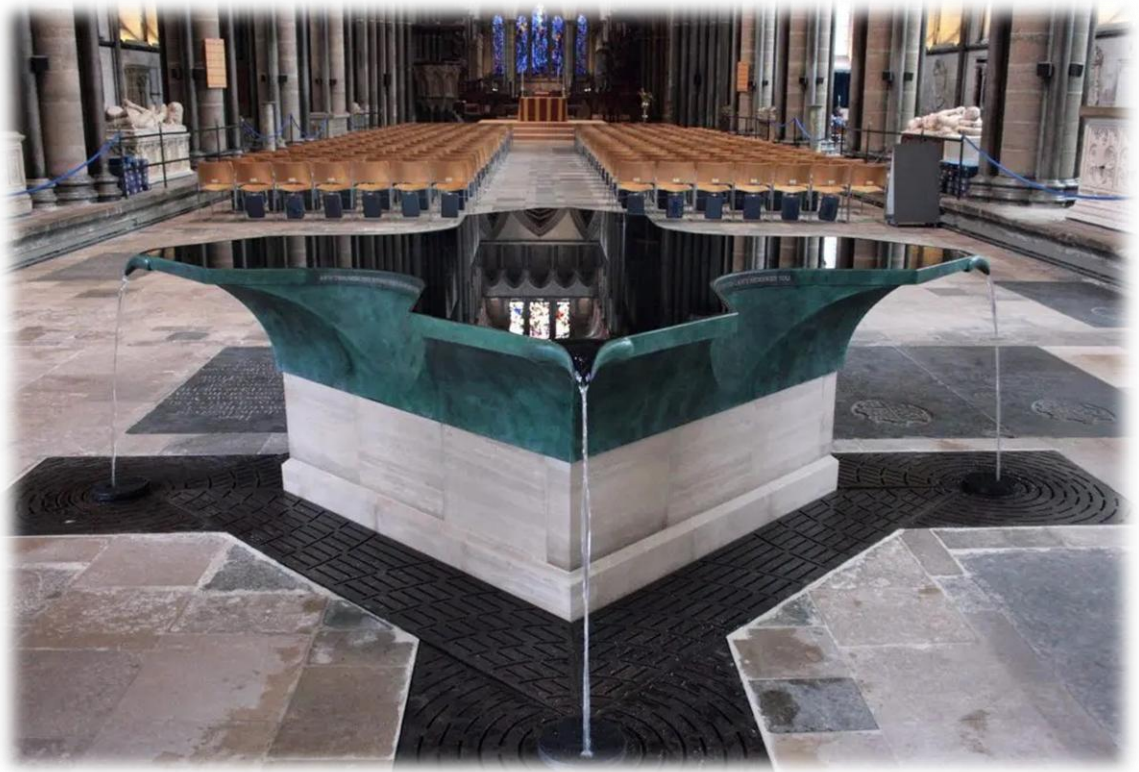
Baptismal Font, Salisbury Cathedral, England