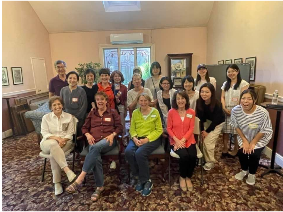
ESL (English as a Second Language)