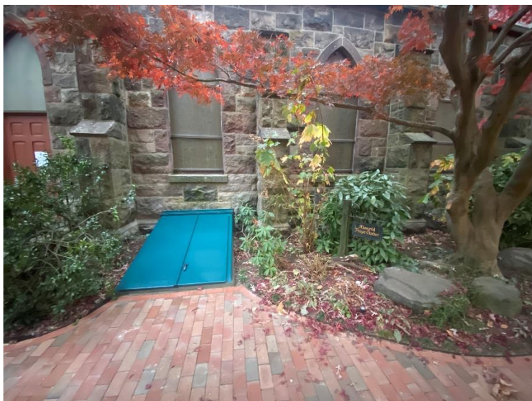
New Chapel basement storm door