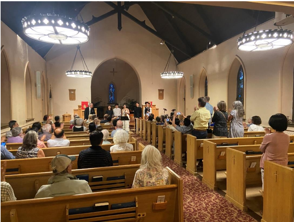
Concert in the Chapel