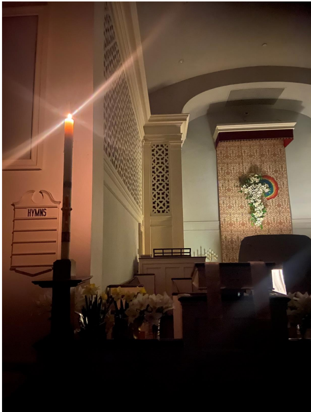
At Dawn on Easter Morning