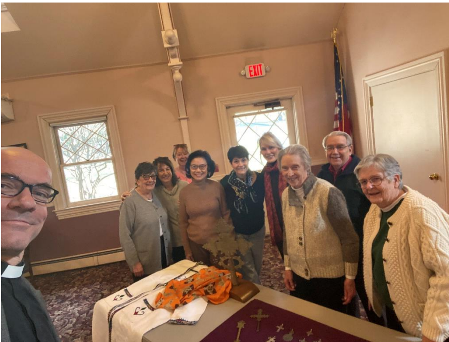
Wednesday Group: Adventures in Faith