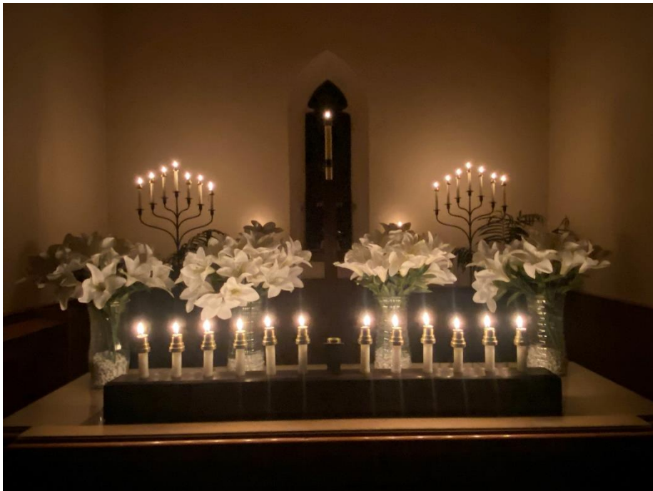
Tenebrae Service for Maundy Thursday