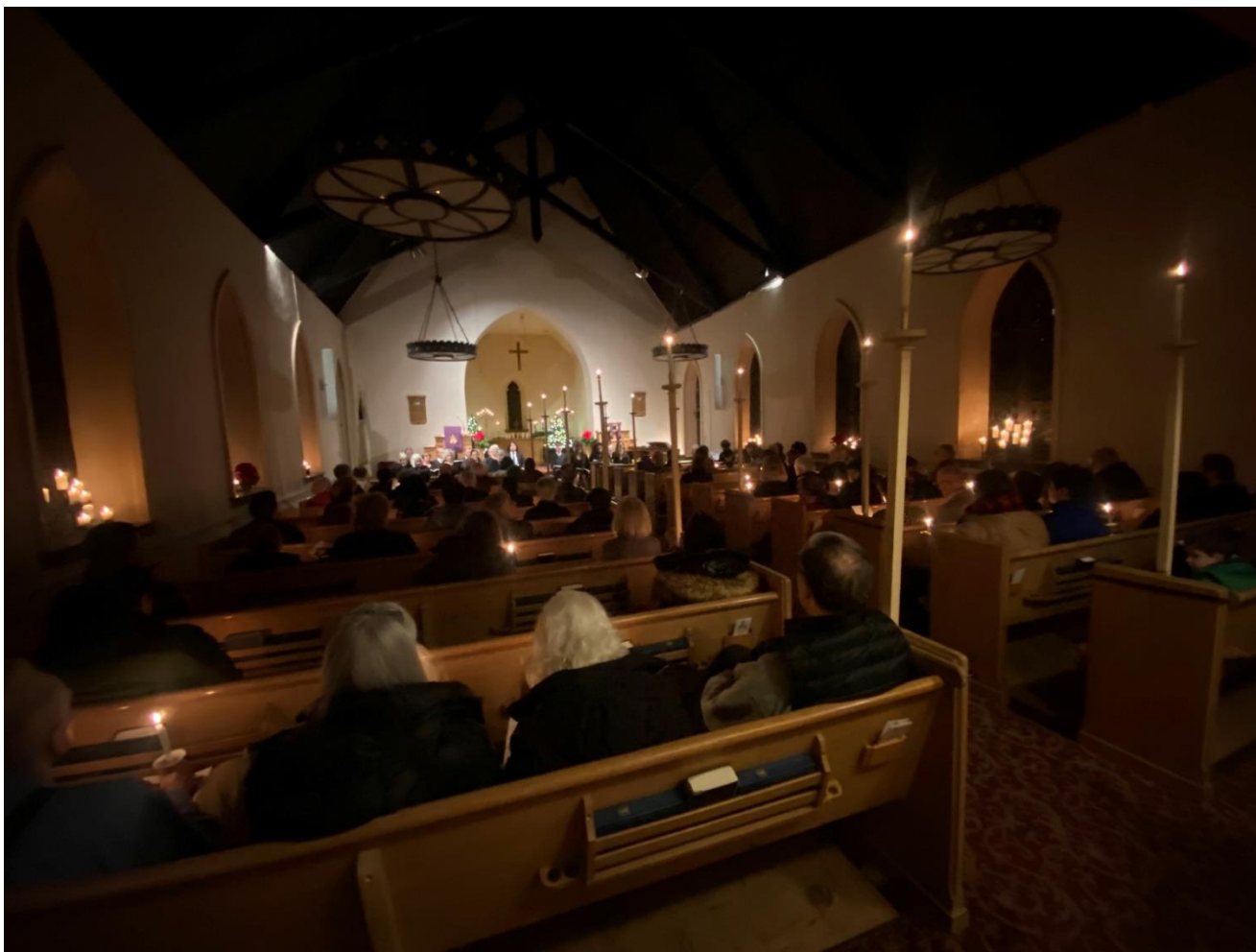
Advent Music and Readings