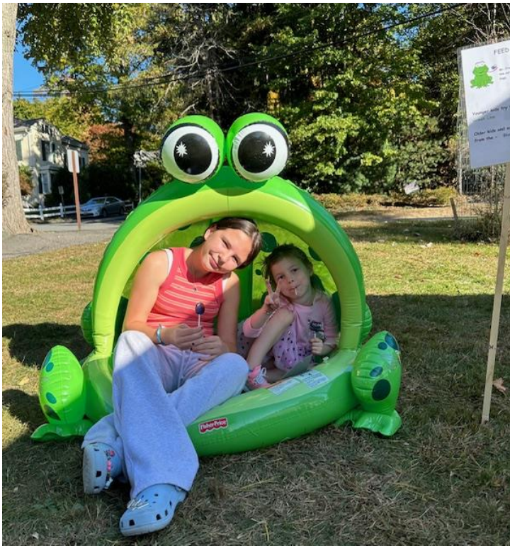
More Fall Festival Fun