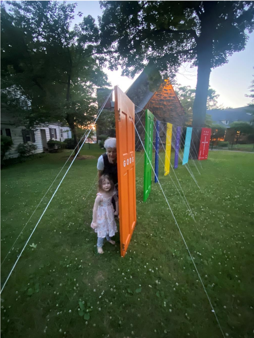
God’s Doors Are Open to All