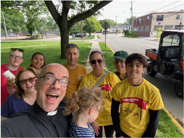
Some of the Volunteers for Tenaflly 5K