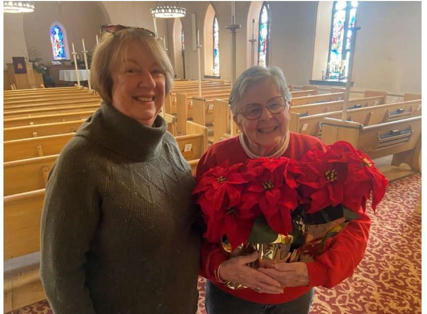
“Greening” of the church