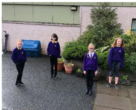
ECO Committee 2020-21