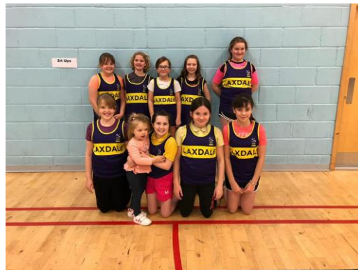
Girls' Football Competition