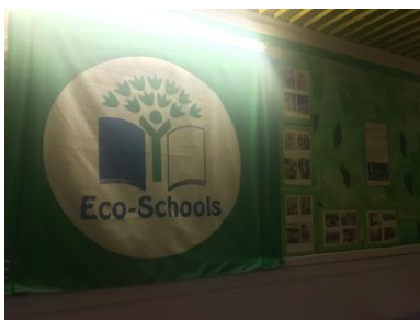
Green Eco Flag

The school was inspected by Her Majesty's Inspectors in April 2008. Copies of their report, in both English and Gaelic, are available at the school. The school participated in an Assisted Self Evaluation in May 2013. Copies of the report were emailed to all families. Laxdale became a Health Promoting School in June 2005 – achieving Gold status. In May 2008 the school achieved a Gold award for Enterprise Education and in April 2009 attained a Bronze award for Eco Schools. In September 2011 we achieved our first Eco Schools Green Flag. In October 2013 we achieved our second Eco Schools Green Flag. In June 2016 we achieved our third Eco Schools Green Flag and in June 2020 we achieved our fourth Eco Schools Green Flag. In June 2018 the school received a Sport Scotland Silver Sports Award. In November 2019 the school were awarded the Sports Scotland Gold Sports Award. In June 2020 we received our Rights Respecting School Silver Award after a virtual accreditation.