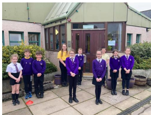
Rights Respecting School Steering Group 2020-21