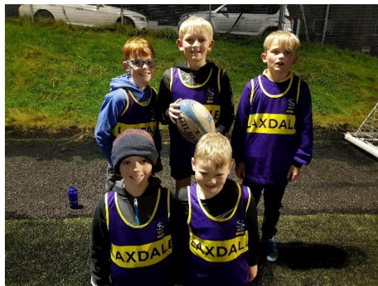
Touch Rugby Festival