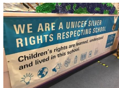
Silver Rights Respecting School Award