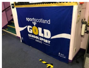
Gold Sports Award