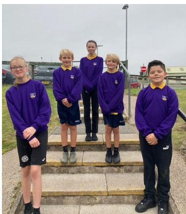
Sports Council 2020-21

Pupil Voice is evident through our development projects and other areas of the curriculum. This session, pupils are represented on the Rights Respecting School Steering Group, Numeracy Group, Eco Committee, Sports Council and House Captains.