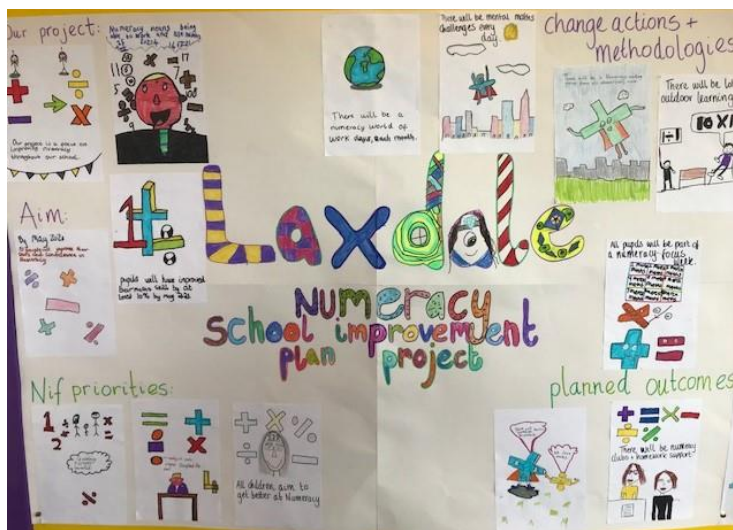
Numeracy Project Plan - Pupil Friendly Version