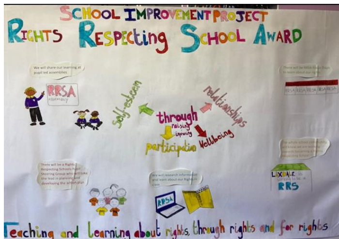
Rights Respecting School Pupil Friendly Version of Project Plan