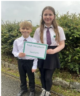
Taigh Shìophoirt – Seaforth