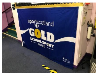
Gold Sports Award