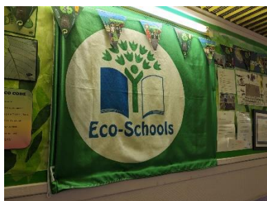
Green Eco Flag