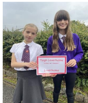
Taigh Leverhulme – Leverhulme