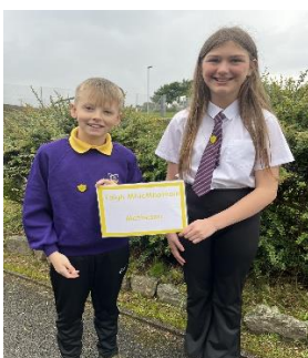
Taigh MhicMhathain – Matheson