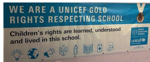
Gold Rights Respecting School Award