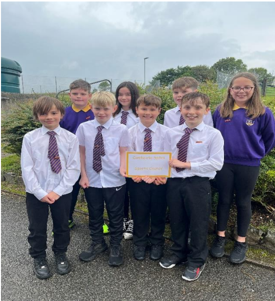
Sports Council 2024-25

Pupil Voice is evident through our development projects and other areas of the curriculum. This session, pupils are represented on the Rights Respecting School Steering Group, Infant Ambassador Group, Eco Committee, Sports Council and House Captains.