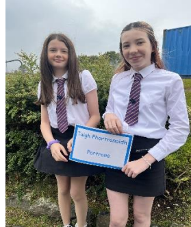
Taigh Phortronaidh – Portrona