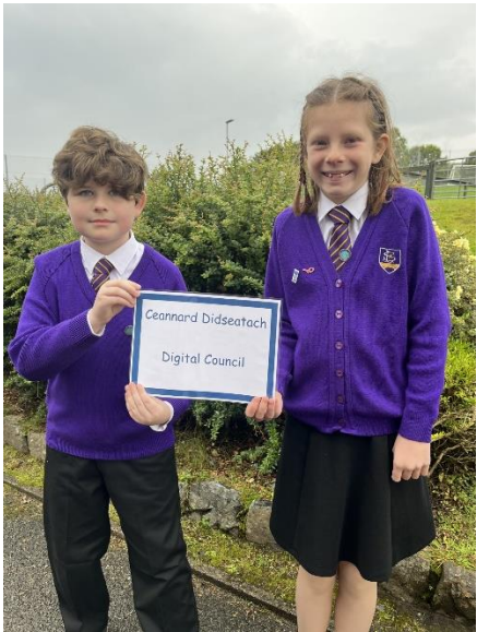
Digital Leaders 2024-25