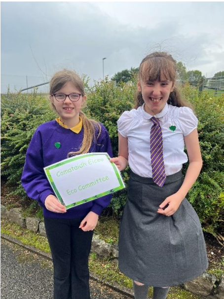
ECO Committee 2024-25