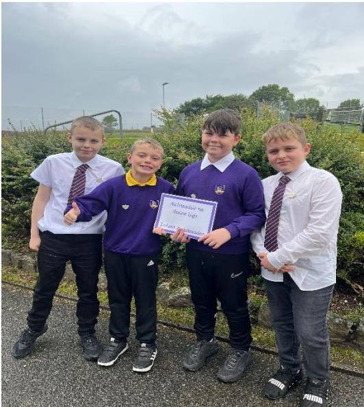
Infant Ambassadors 2024-25