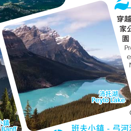
沛托湖 Peyto Lake