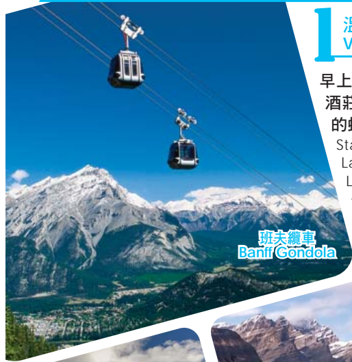
班夫纜車 Banff Gondola

* 送早餐由酒店提供，視其供應情況而定 Comp. Breakfast subject to hotel availability