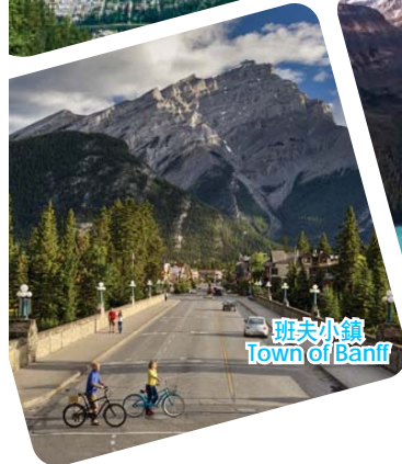
班夫小鎮 Town of Banff