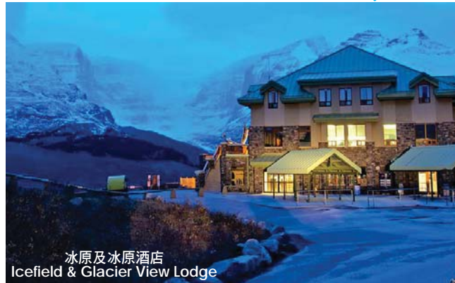
冰原及冰原酒店 Icefield & Glacier View Lodge