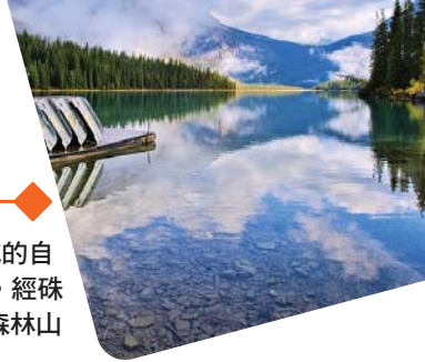
翡翠湖 Emerald Lake