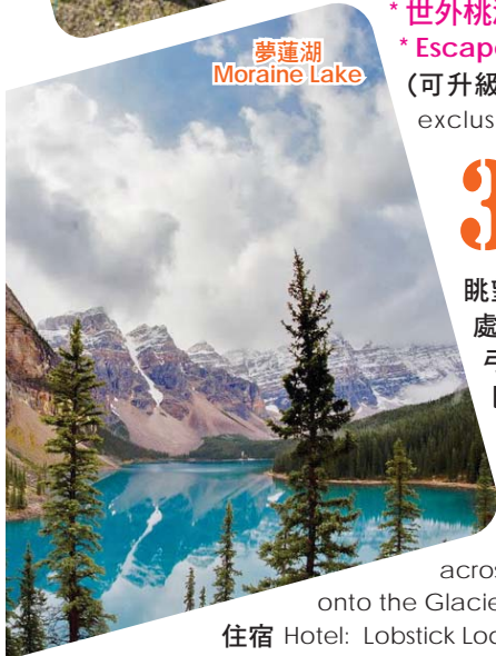
夢蓮湖 Moraine Lake