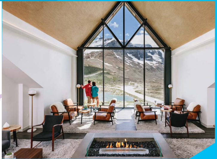
冰川景觀度假酒店 - 2019全新裝修 全球限量 32個房間 Glacier View Lodge - Newly Renovated with Only 32 Rooms