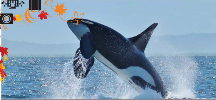
溫哥華島·杜芬奴·觀鯨·生態兩天遊 Vancouver Island & Tofino Whale Watching 2 Days Tour [TOF02]