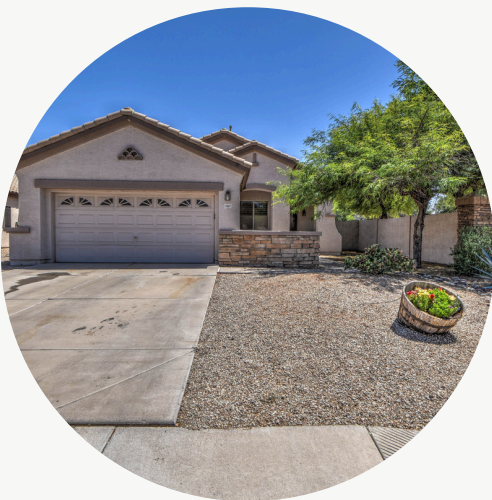
2567 E. Brooks $250 for 12 month lease