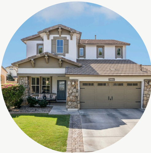
4225 E. Page Ave. 2.5% co-broke offered