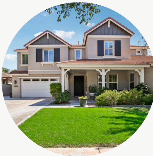
3563 E. Comstock Dr. 2% co-broke offered