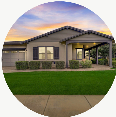
3717 E. Appaloosa 2.5% co-broke offered