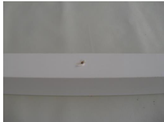
1/8" HOLE OUT THE BACK OF STILE