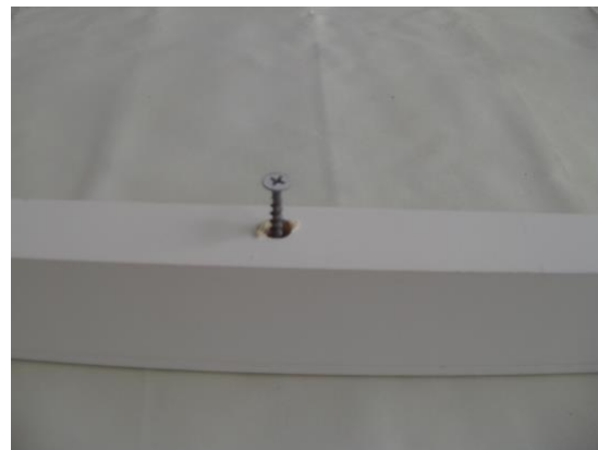
#6 X 1-1/8" SCREW FLATEN SHARP END OF SCREW