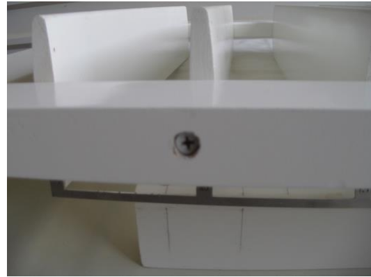
TENSION SCREW IN PLACE