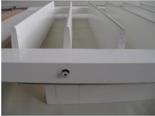
TENSION SCREW IN PLACE