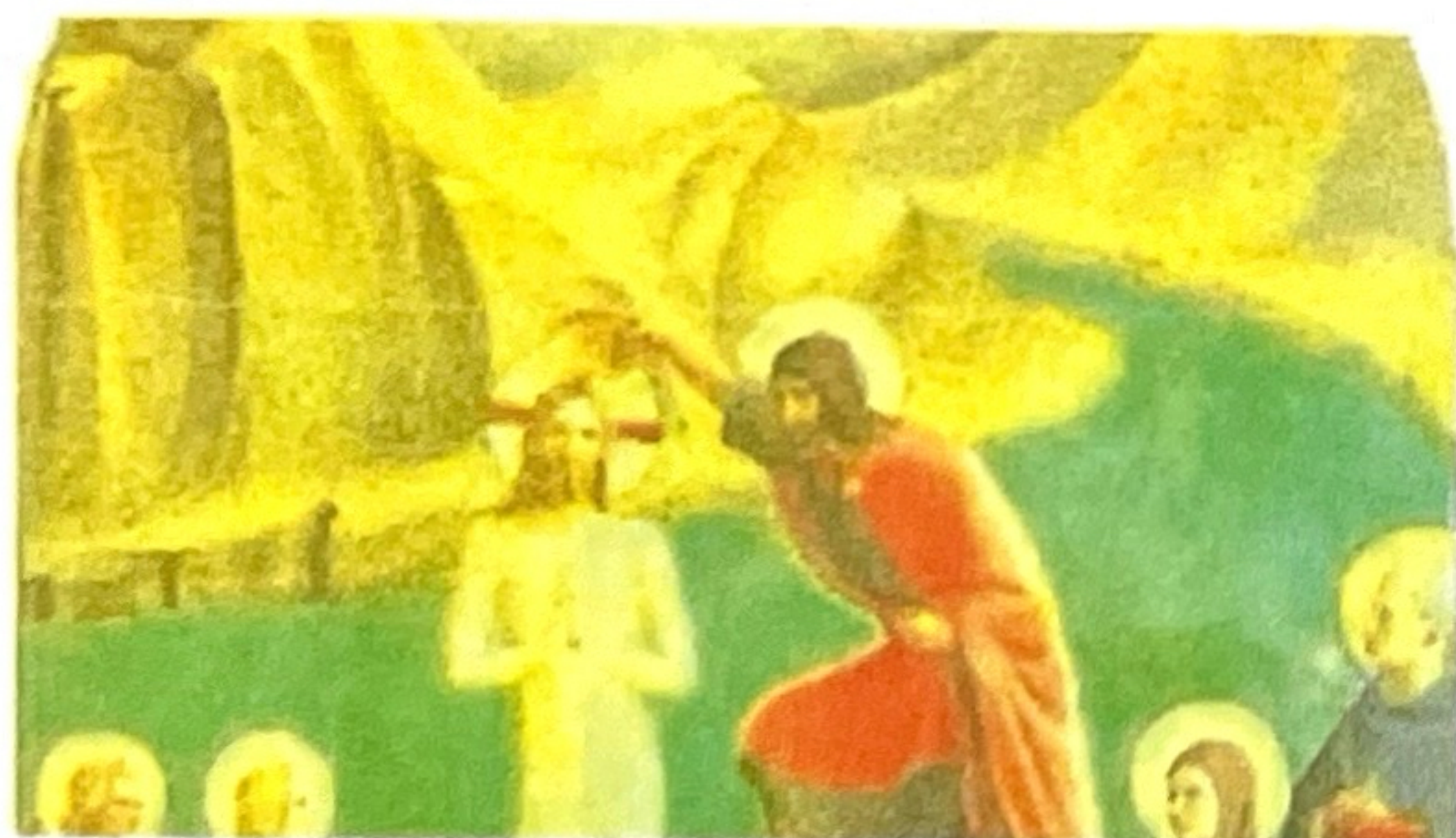
Baptism of Christ

Easter and Christmas). Roman Catholics, Lutherans, Anglicans, and other Western churches observe the feast on January 6, while some Eastern Orthodox churches celebrate Epiphany on January 19, since their Christmas Eve falls on January 6.