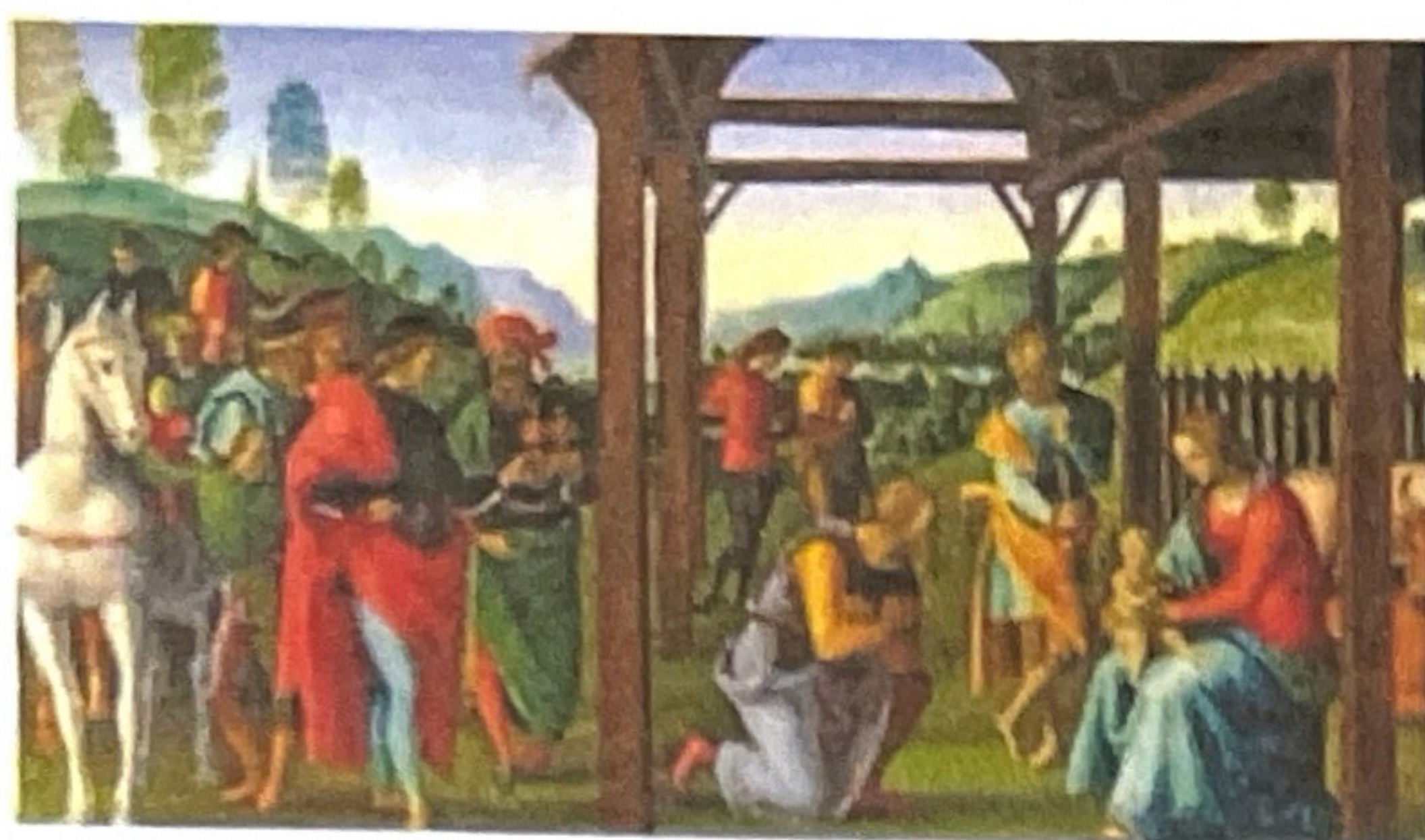
Perugino: Adoration of the Magi

Adoration of the Magi , oil on wood by Perugino, c. 1496–98; in the Musée des Beaux-Arts, Rouen, France.