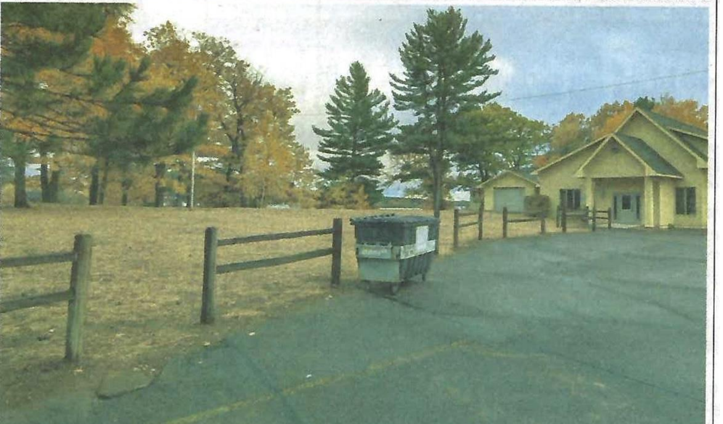
THE ATTIC THEN AND NOW