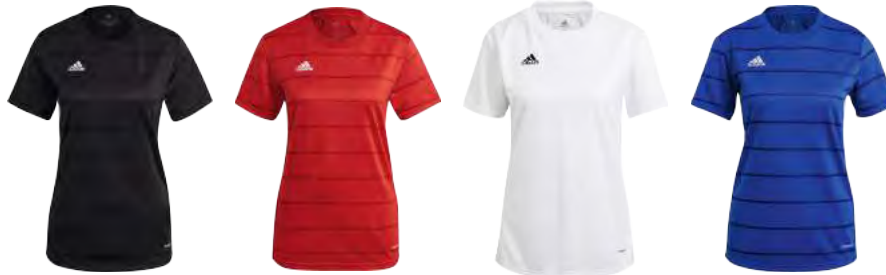
GN5730 12/01/21 GN5734 12/01/21 GN5735 12/01/21 GK9086 12/01/21