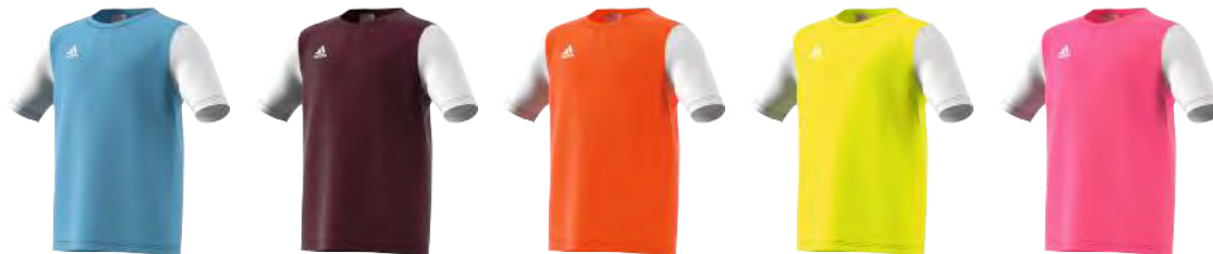
FT6559 12/01/21 DP3224 12/01/21 DP3227 12/01/21 DP3229 12/01/21 DP3228 12/01/21