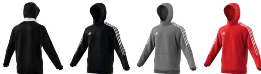
GM7341 12/01/21 GP8805 12/01/21 GM7353 12/01/21