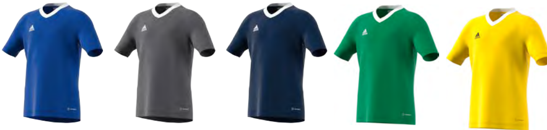
HG3948 2/1/22 H57499 2/1/22 H57564 2/1/22 HI2126 2/1/22 HI2127 2/1/22

ENTRADA22 Jersey Youth $18.00 S2206GHTT420Y