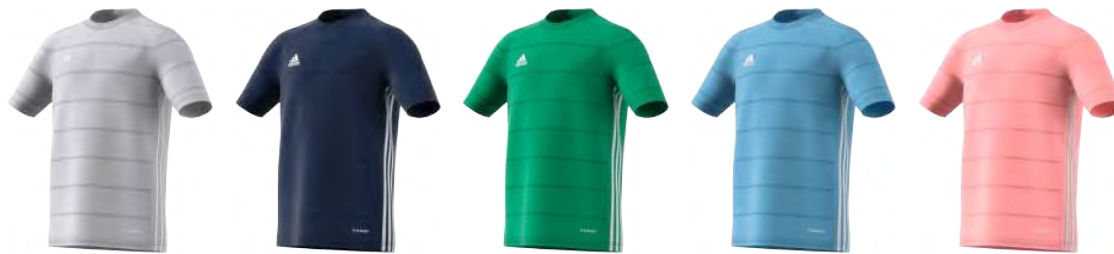
GN5736 12/01/21 GN7495 12/01/21 GN7494 12/01/21 GN7493 12/01/21 FT6757 12/01/21