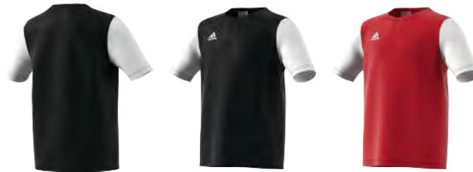
DP3220 12/01/21 DP3215 12/01/21