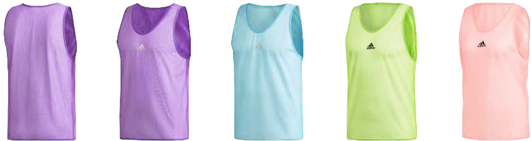
FM4407 12/01/21 FM4408 12/01/21 FM4409 12/01/21 FM4410 12/01/21