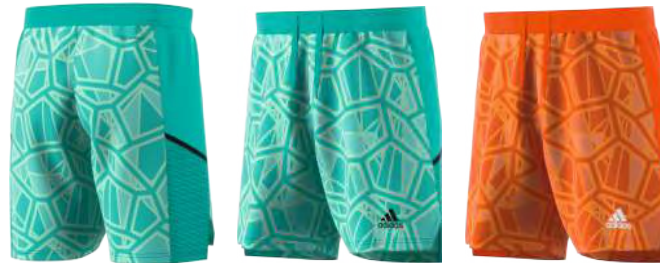
HB1624 12/01/21 HB1627 12/01/21

CONDIVO GK 22 SHORT MEN $35.00 S2206GHTM102