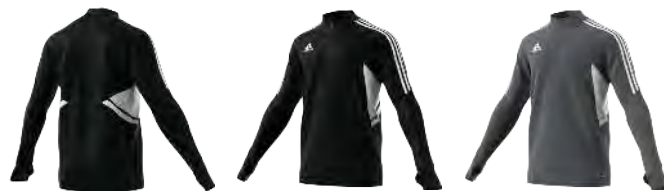
HA6269 12/01/21 HD2312 12/01/21