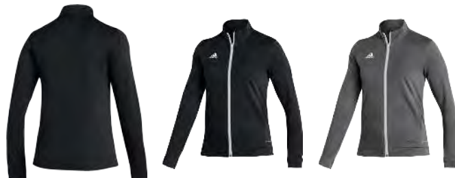
H57525 12/01/21 H57527 12/01/21

ENTRADA22 Track Jacket Women $45.00 S2206GHTT405W