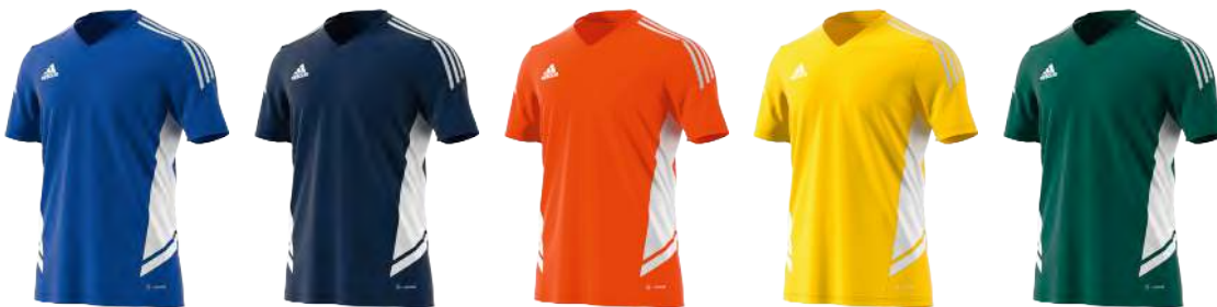
HA6285 12/01/21 HA6291 12/01/21 HE3059 12/01/21 HD2267 12/01/21 HE3057 12/01/21