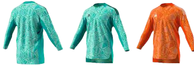
HB1613 12/01/21 HB1617 12/01/21

CONDIVO 22 GK JERSEY LONGSLEEVE MEN S2206GHTM001L $65.00