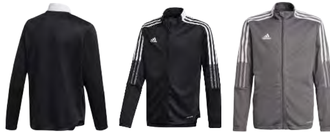
GM7314 12/01/21 GM7311 12/01/21