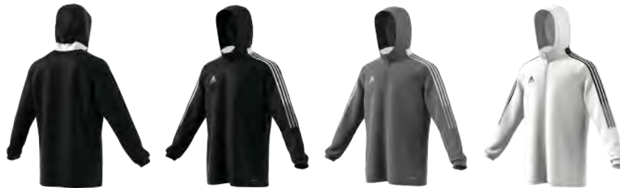
GP4967 12/01/21 GP4964 12/01/21 GP4966 12/01/21