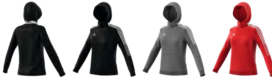
GM7329 12/01/21 GP8804 12/01/21 GM7327 12/01/21