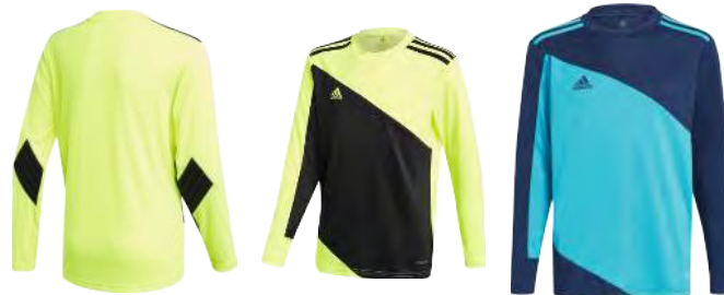
GN5794 12/01/21 GN6947 12/01/21