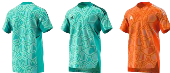
HB1618 12/01/21 HB1621 12/01/21

CONDIVO 22 GK JERSEY SHORTSLEEVE MEN S2206GHTM001 $60.00