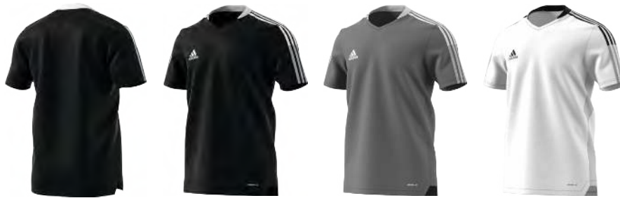
GM7586 12/01/21 GM7587 12/01/21 GM7590 12/01/21