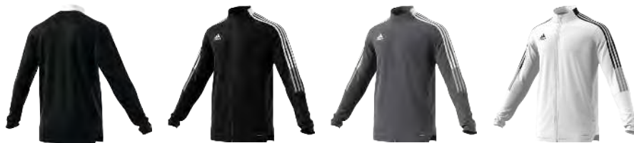
GM7319 12/01/21 GM7306 12/01/21 GM7309 12/01/21