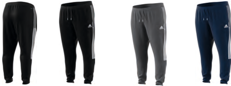
GN2173 12/01/21 GU8199 12/01/21 GJ5664 12/01/21