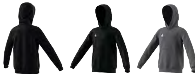
H57516 12/01/21 H57515 12/01/21

ENTRADA22 Sweat Hoody Youth S2206GHTT406Y