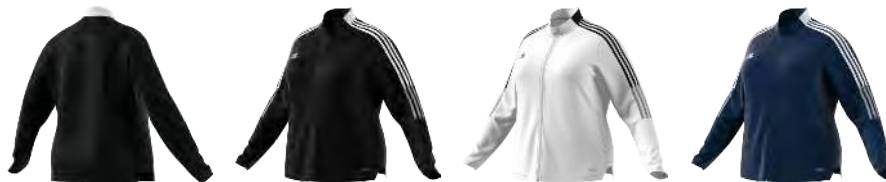
GN2171 12/01/21 GU8193 12/01/21 GJ5663 12/01/21