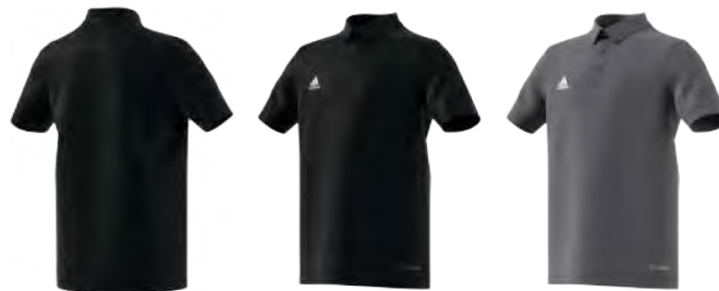
H57481 12/01/21 H57485 12/01/21

ENTRADA22 Polo Youth $25.00 S2206GHTT402Y