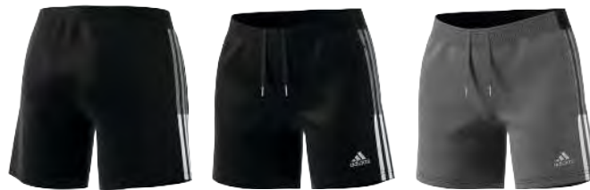
GM7330 12/01/21 GP8807 12/01/21

Tiro 21 Sweat Shorts Women $35.00 S2106GHTT111W