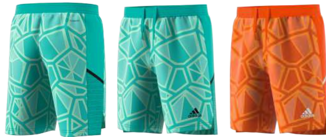
HB1668 12/01/21 HB1669 12/01/21