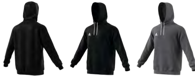
H57512 12/01/21 HB0578 12/01/21