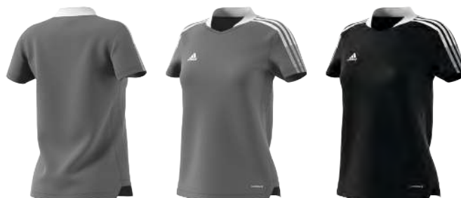
GM7581 12/01/21 GM7582 12/01/21