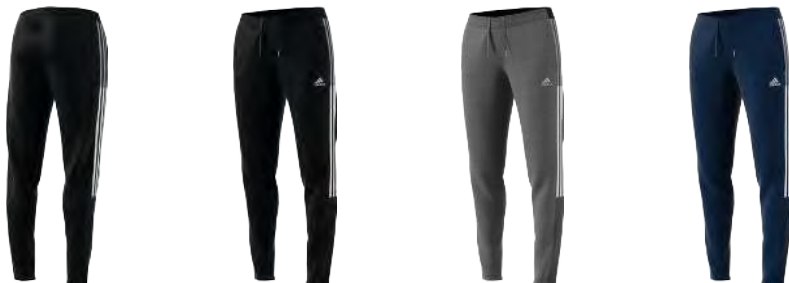
GM7334 12/01/21 GP8801 12/01/21 GK9676 12/01/21