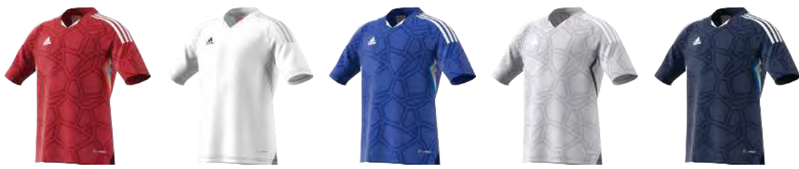
HA3567 12/01/21 HA3558 12/01/21 GS0180 12/01/21 HA3559 12/01/21 HA3560 12/01/21