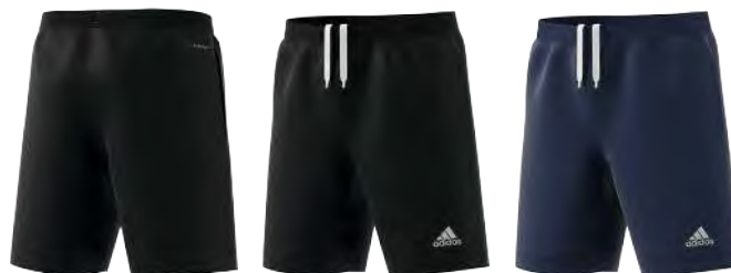
H57498 12/01/21 H57500 12/01/21

ENTRADA22 Training Shorts Youth S2206GHTT410Y Material: 100% rec polyester, Zip Pockets Sizes: XXS | XS | S | M | L | XL