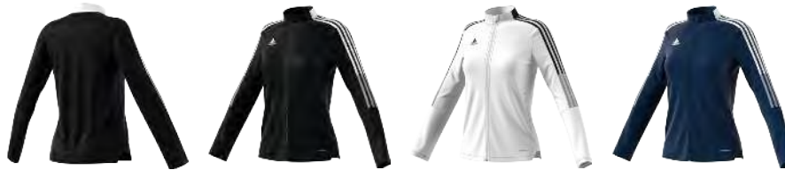
GM7307 12/01/21 GM7302 12/01/21 GK9663 12/01/21