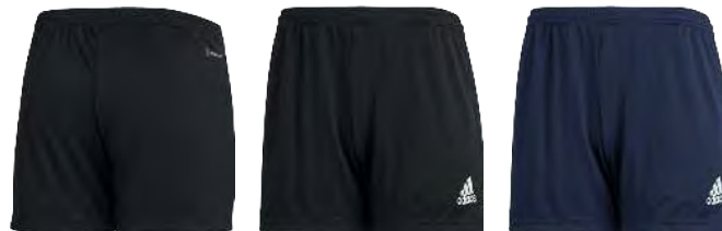
H57492 12/01/21 H57494 12/01/21

ENTRADA22 Training Shorts Women S2206GHTT410W Material: 100% rec polyester, Zip Pockets Sizes: XXS | XS | S | M | L | XL | XXL