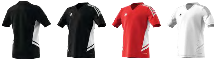
HA6278 12/01/21 HA6280 12/01/21 HD4718 12/01/21