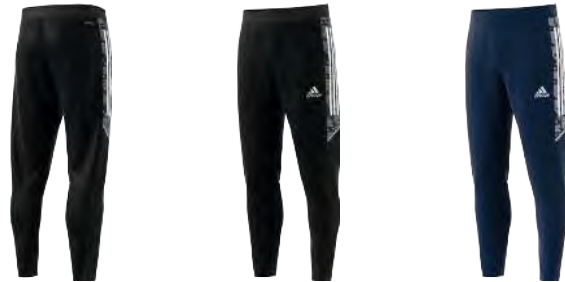
GE5423 12/01/21 GH7134 12/01/21