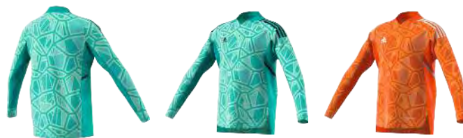
HB1642 12/01/21 HB1645 12/01/21

CONDIVO 22 GK JERSEY LONGSLEEVE YOUTH $55.00 S2206GHTM001LY