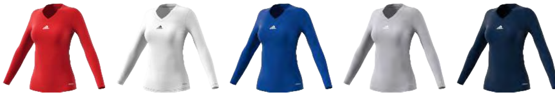
GN5715 12/01/21 GN5716 12/01/21 GK9089 12/01/21 GN5717 12/01/21 GN5714 12/01/21