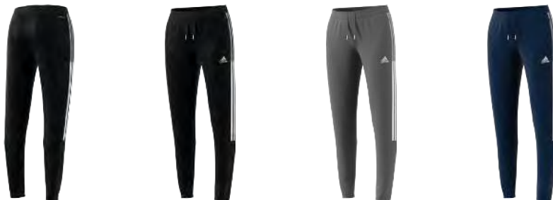
GM7310 12/01/21 GM7385 12/01/21 GK9667 12/01/21