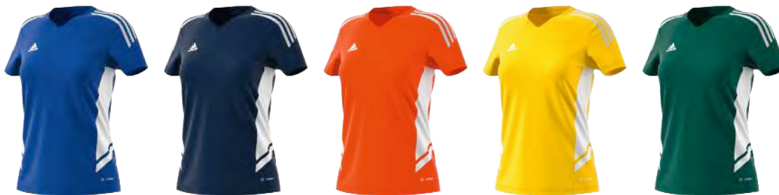
HD4724 12/01/21 HA6289 12/01/21 HE3061 12/01/21 HD4730 12/01/21 HE3060 12/01/21

CONDIVO22 JERSEY WOMEN $45.00 S2206GHTT001W