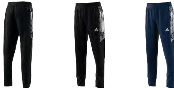
GK9572 12/01/21 GH7132 12/01/21