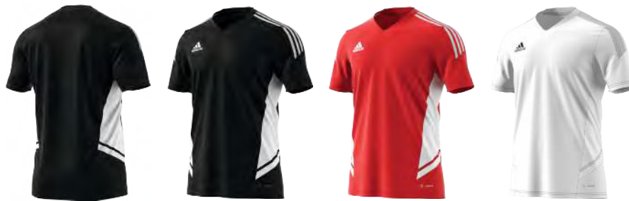
H21254 12/01/21 HA6286 12/01/21 HD2275 12/01/21