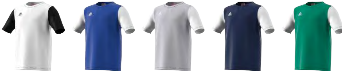
DP3221 12/01/21 DP3217 12/01/21 FT6560 12/01/21 DP3219 12/01/21 DP3216 12/01/21