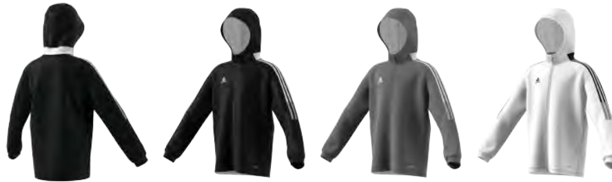
GP4975 12/01/21 GP4977 12/01/21 GP4979 12/01/21