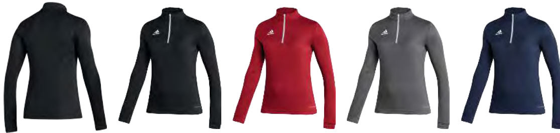
H57541 12/01/21 H57551 12/01/21 H57542 12/01/21 H57483 12/01/21

ENTRADA22 Training Top Women $40.00 S2206GHTT403W