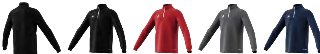
H57547 12/01/21 H57550 12/01/21 H57549 12/01/21 H57484 12/01/21

ENTRADA22 Training Top Youth $35.00 S2206GHTT403Y