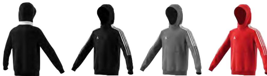
GM7326 12/01/21 GP8803 12/01/21 GM7338 12/01/21