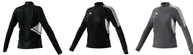
H21250 12/01/21 HD2308 12/01/21

CONDIVO22 TRAINING TOP WOMEN S2206GHTT004W $65.00