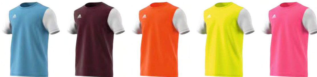
FT6561 12/01/21 DP3239 12/01/21 DP3236 12/01/21 DP3235 12/01/21 DP3237 12/01/21