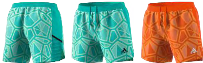
HB1663 12/01/21 HB1660 12/01/21

CONDIVO GK 22 SHORT WOMEN $35.00 S2206GHTM102W