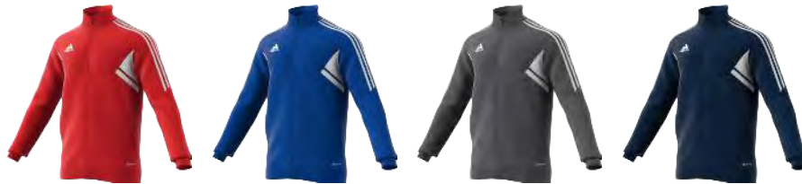
HA6250 12/01/21 HB0005 12/01/21 HD2286 12/01/21 HA6249 12/01/21