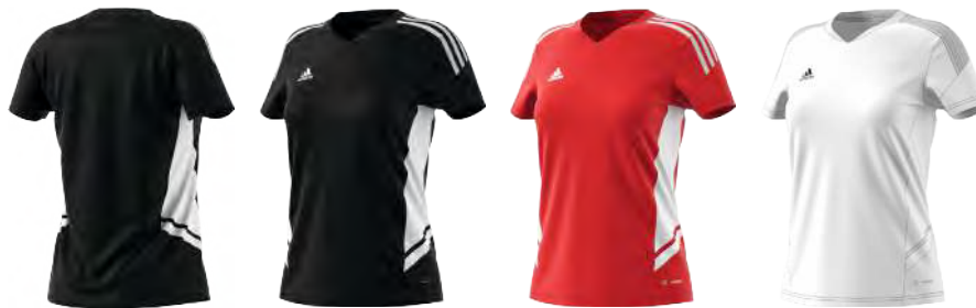
H21258 12/01/21 HD4725 12/01/21 HD4728 12/01/21