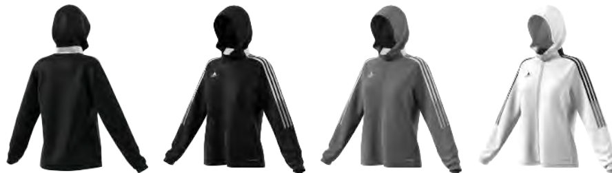
GP4969 12/01/21 GP4971 12/01/21 GP4970 12/01/21