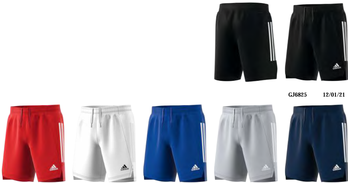
GJ6827 12/01/21 GJ6826 12/01/21 GF3362 12/01/21 GJ6824 12/01/21 GJ6823 12/01/21