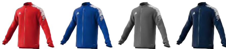
GH7124 12/01/21 GH7130 12/01/21 GP1900 12/01/21 GE5412 12/01/21