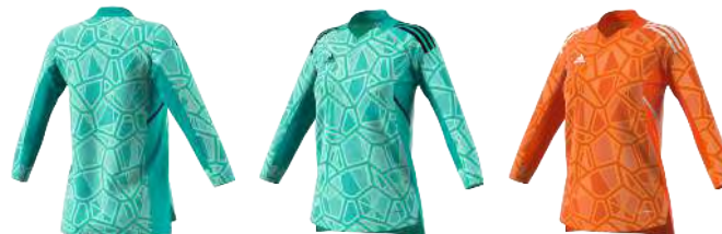
HB1659 12/01/21 HB1656 12/01/21

CONDIVO 22 GK JERSEY LONGSLEEVE WOMEN $65.00 S2206GHTM001LW