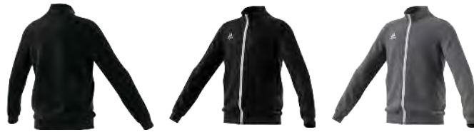
H57520 12/01/21 H57521 12/01/21

ENTRADA22 Track Jacket Youth S2206GHTT405Y