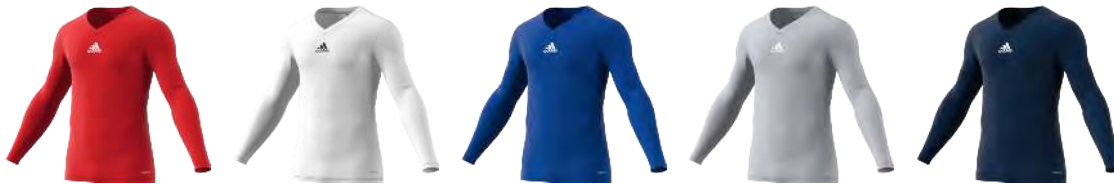
GN5674 12/01/21 GN5676 12/01/21 GK9088 12/01/21 GN5708 12/01/21 GN5675 12/01/21