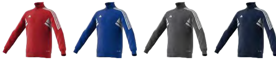
HA6256 12/01/21 HA6257 12/01/21 HD2284 12/01/21 H21282 12/01/21