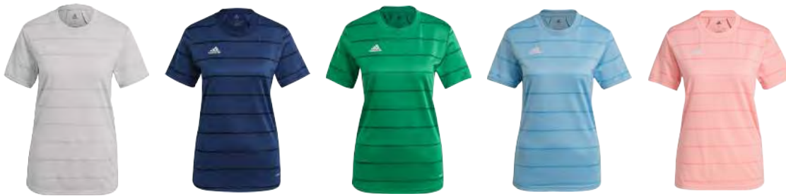
GN5732 12/01/21 GN5733 12/01/21 GN6704 12/01/21 GN6703 12/01/21 GN5731 12/01/21