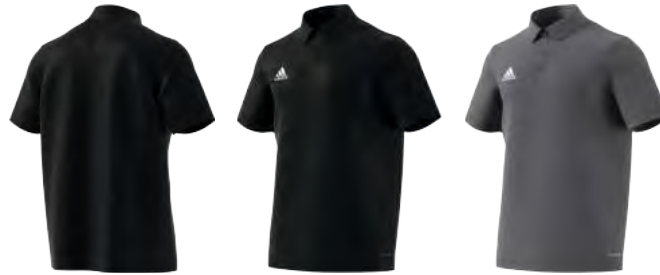
HB5328 02/01/22 H57486 12/01/21