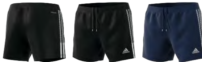
GN2158 12/01/21 GK9682 12/01/21