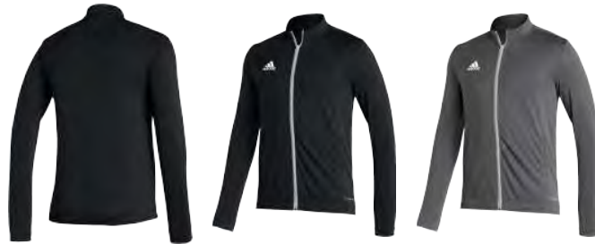
HB0573 02/01/22 H57522 12/01/21

ENTRADA22 Track Jacket $45.00 S2206GHTT405