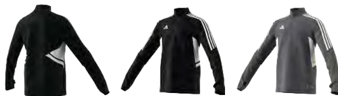
H21249 12/01/21 HD2303 12/01/21

CONDIVO22 TRAINING TOP YOUTH S2206GHTT004Y $60.00