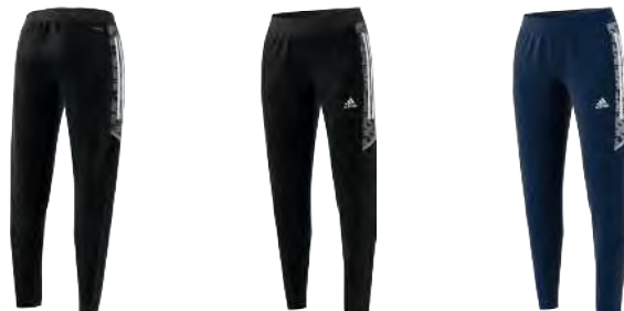
GK9571 12/01/21 GH7131 12/01/21