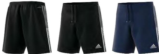
GN2157 12/01/21 GH4471 12/01/21