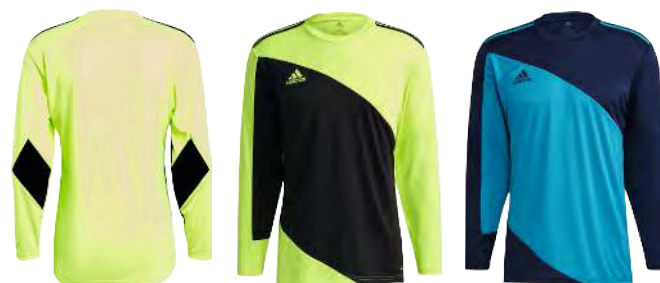
GN5795 12/01/21 GN6944 12/01/21