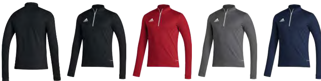
H57544 12/01/21 H57556 02/01/22 H57546 02/01/22 HB5327 02/01/22