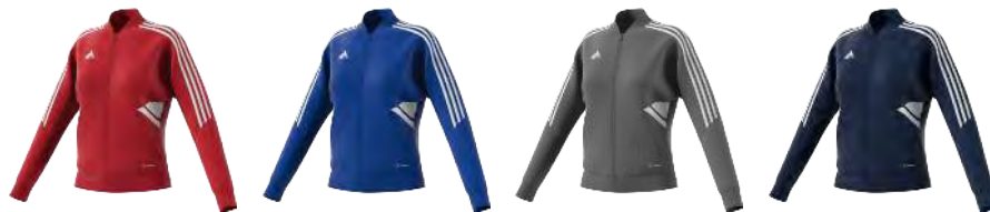
HA6243 12/01/21 HB0002 12/01/21 HD2280 12/01/21 HA6242 12/01/21