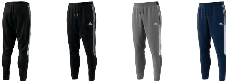
GM7336 12/01/21 GP8802 12/01/21 GH4467 12/01/21