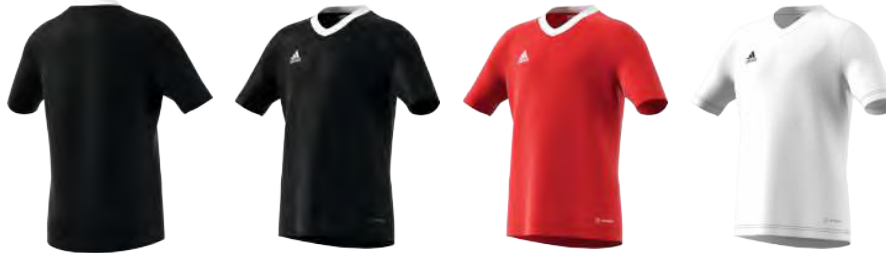
H57497 02/1/22 H57496 2/1/22 HC5054 2/1/22