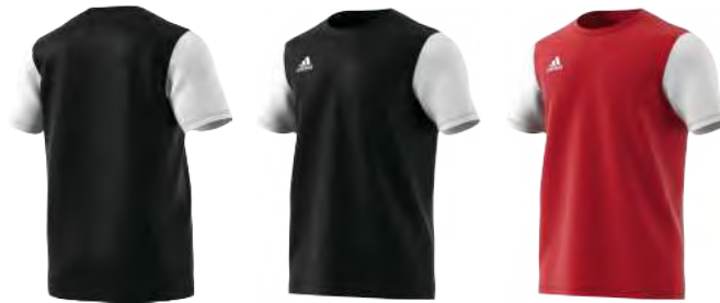
DP3233 12/01/21 DP3230 12/01/21