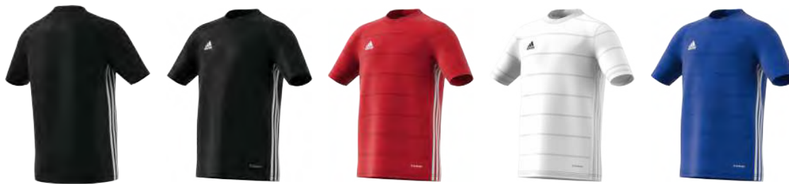
FT6756 12/01/21 FT6759 12/01/21 GN5737 12/01/21 FT6758 12/01/21