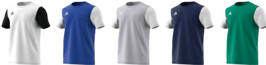
DP3234 12/01/21 DP3231 12/01/21 FT6558 12/01/21 DP3232 12/01/21 DP3238 12/01/21