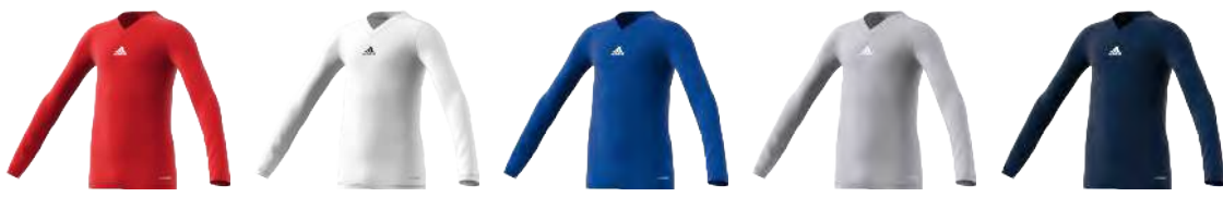
GN5711 12/01/21 GN5713 12/01/21 GK9087 12/01/21 GN5709 12/01/21 GN5712 12/01/21