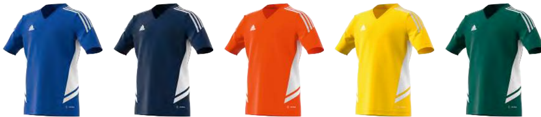
HA6279 12/01/21 H21257 12/01/21 HE3065 12/01/21 HD2321 12/01/21 HE3064 12/01/21

CONDIVO22 JERSEY YOUTH $40.00 S2206GHTT001Y