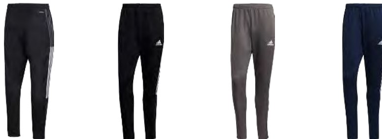
GH7305 12/01/21 GJ9868 12/01/21 GE5425 12/01/21