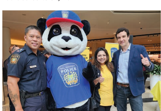
Cops for Cancer fundraiser at Square One Shopping Centre.