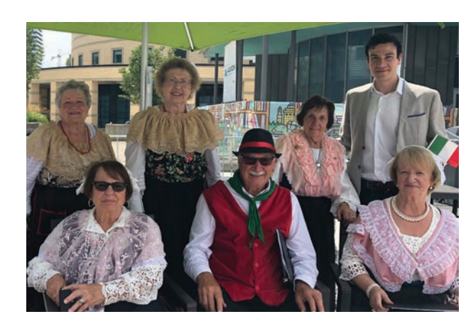
Mississauga's ITALFEST at Celebration Square.