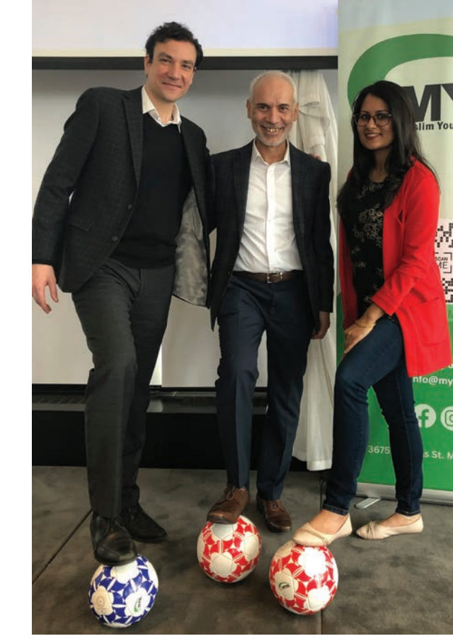
Appreciation Brunch for members of the Muslim Youth Soccer League.