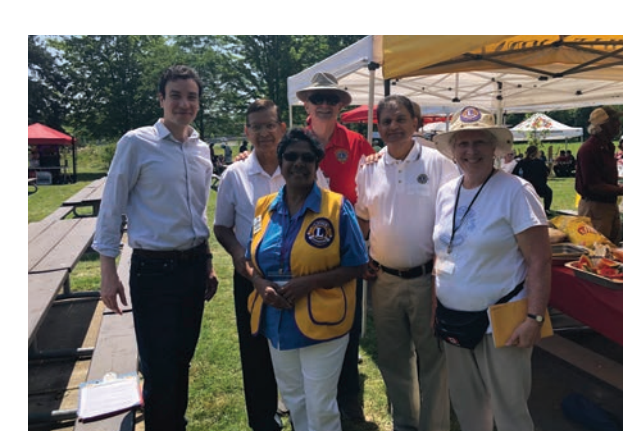
Mississauga Central Lions Club annual summer picnic.