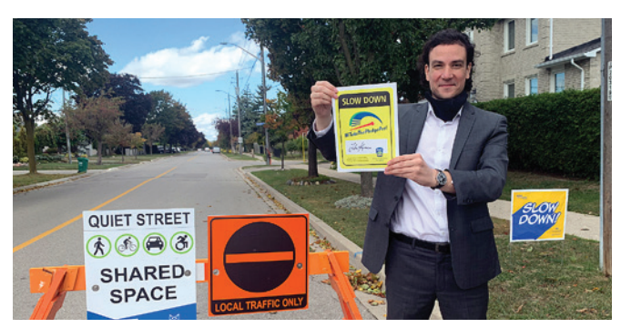
Join me and #TakeThePledgePeel - let's work together to reduce driving speeds for a safer community!

Through the Distracted Driving campaign and other programs, we're working closely with Peel Regional Police and the Ontario Provincial Police Caledon detachment to support enforcement efforts.