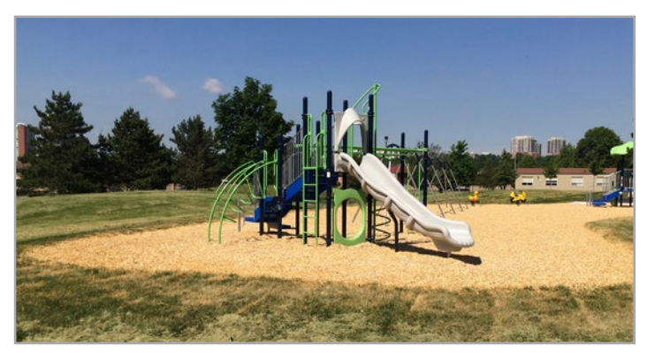
Parkway Green - newly redeveloped playground