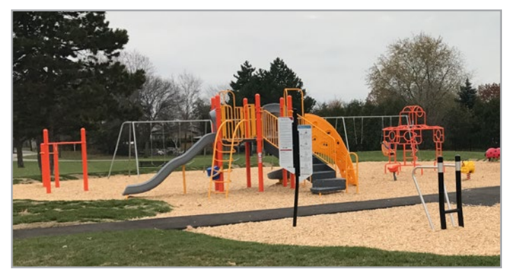
Brentwood Park – newly redeveloped playground