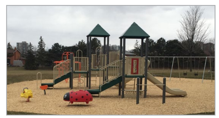
Rayfield Park - newly redeveloped playground