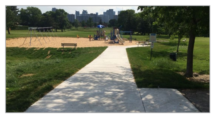
Greenfield Park – newly redeveloped playground