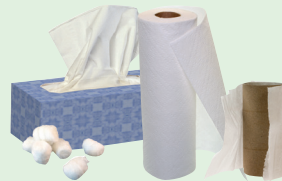
Cotton Balls, Facial Tissue, Paper Towels and Toilet Paper Rolls