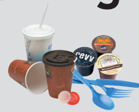
Plastic Cutlery, Bottle Caps, and Single Serve Coffee/Tea Pods/KCups, Hot and Cold Drink Cups, Lids, Straws and Stir Sticks