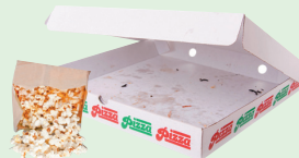
Greasy Pizza Boxes, Microwave Popcorn Bags