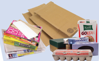
Cardboard and Printed Paper