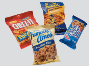
Plastic Liner Bags and Wrappers (cereal, cookies, crackers, candy, chips, chocolate bars)