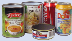
Metal Food and Beverage Cans