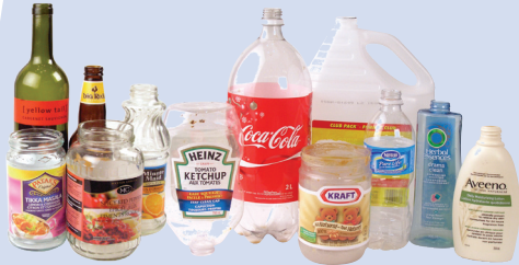
Plastic/Glass Bottles and Jars (throw caps in garbage)