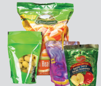
Plastic Coated Standing Food and Drink Pouches