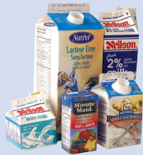
Beverage Cartons and Juice Boxes