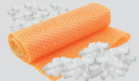
Plastic Bubble Wrap and Polystyrene Packaging Peanuts