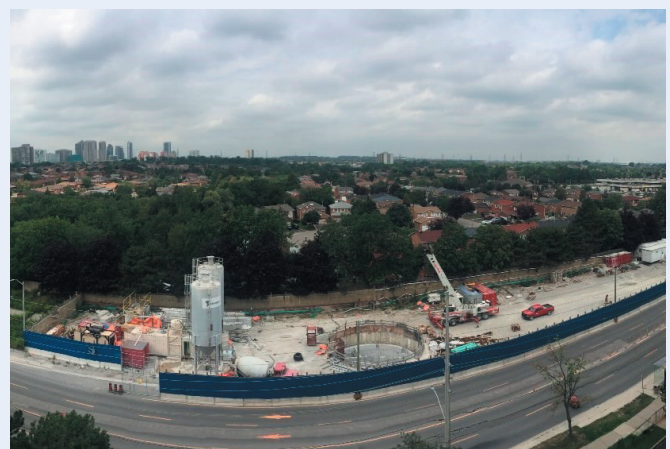
The construction compound and chamber at Burnhamthorpe Road and Central Parkway.