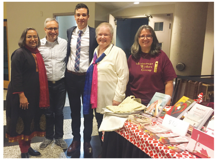
at 'Mississauga Writers Group' event