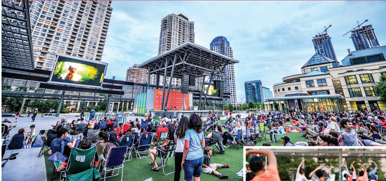
Movie nights, fitness classes, festivals and much more this summer on the Square

The Mississauga Celebration Square summer event season begins on Victoria Day weekend and goes through to Labour Day weekend.