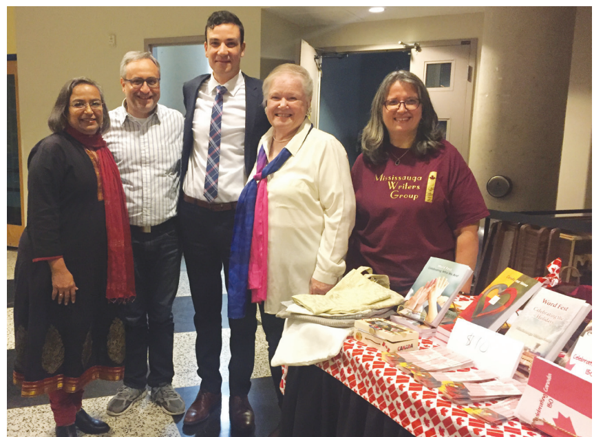
at 'Mississauga Writers Group' event