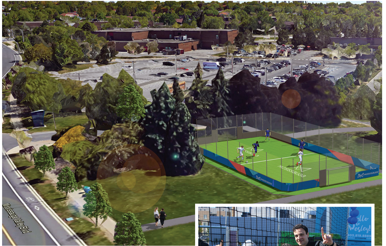
New boxed soccer pitch coming to Mississauga Valley Park