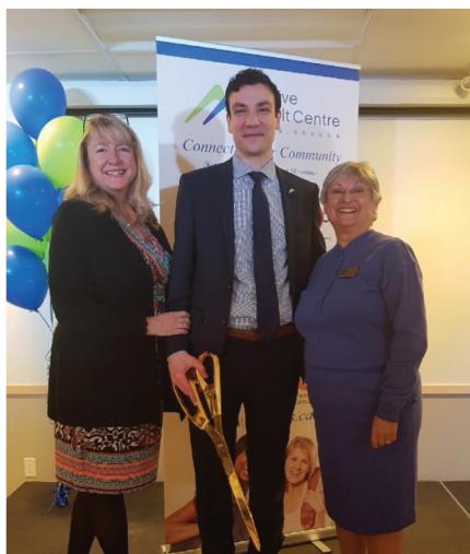
at opening of 'Active Adult Centre'