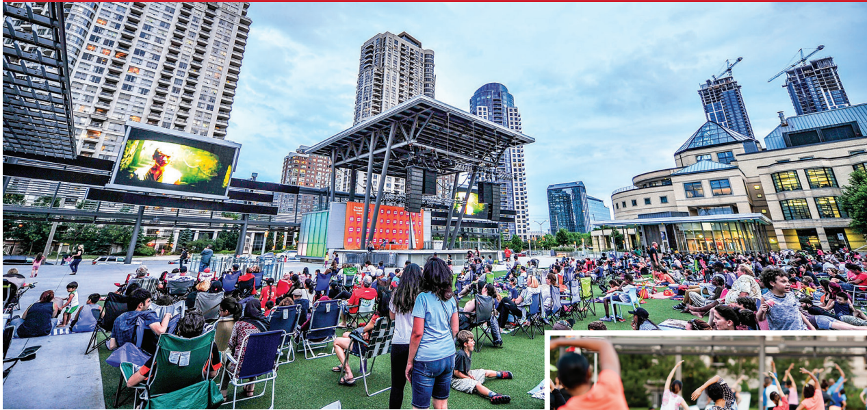
Movie nights, fitness classes, festivals and much more this summer on the Square

The Mississauga Celebration Square summer event season begins on Victoria Day weekend and goes through to Labour Day weekend.