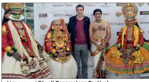
At inaugural Diwali Razzmatazz Festival.