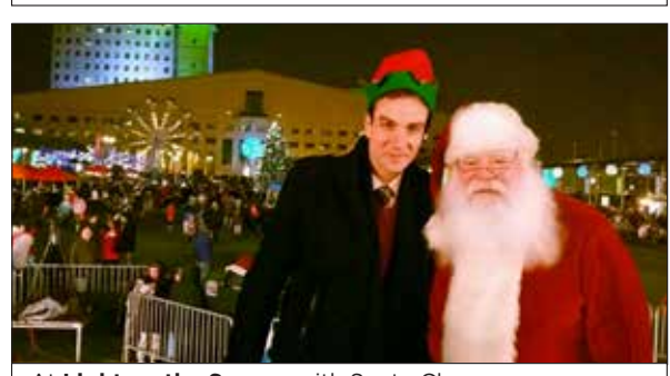
At Light up the Square with Santa Claus