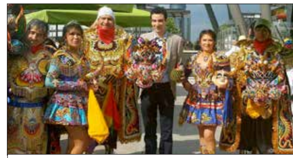
At inaugural Latin Festival