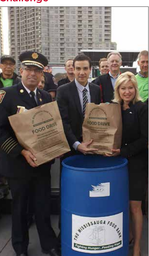
The community pulled together to fight hunger this past Thanksgiving by raising $82,917 and 148,900 pounds of food enough to distribute food for 207,293 meals.