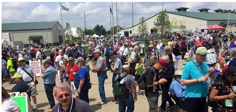
Dayton Hamvention 2024