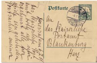
Early usage (before cataloged release date).