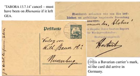
110 is a Bavarian carrier's mark, so the card did arrive in Germany.

'TABORA 13.7.14' cancel – must have been on Rhenania if it left GEA.