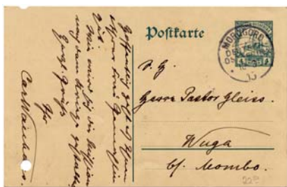
MOROGORO WWI usage – note locally produced '15' year date