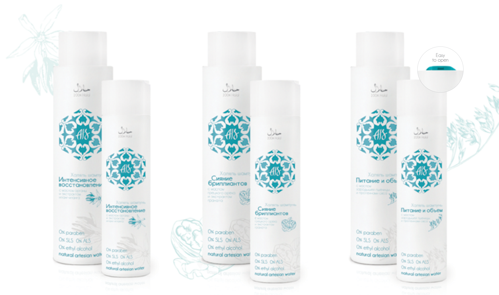
▲ Intensive Recovery AIS Halal shampoo With ylang-ylang extract and argan oil 250 ml / 400 ml