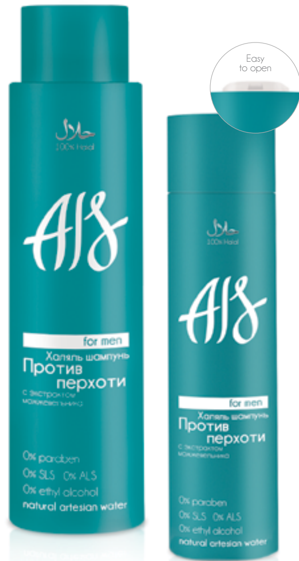
▲ Anti-dandruff AIS Halal Shampoo With juniper extracts 250/400 ml

IS shampoos for men are made for hair and scalp care. Climbazole in anti-dandruff shampoo not only eliminates dandruff, but prevents it from reappearing, and bioactive complex included in complex care shampoo strengthens hair roots and prevents hair loss.