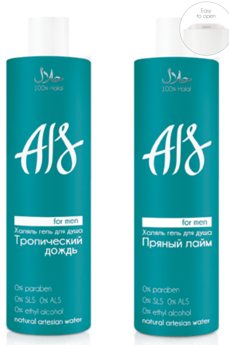
▲ Tropical Rain AIS Halal Shower Gel For Men 250 ml

AIS shower gels make a lot of foam, carefully cleanse the skin and provide energy for the whole day.