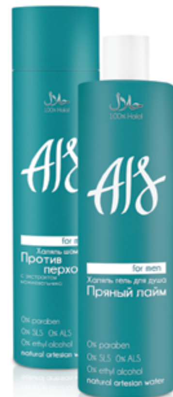
◀ AIS Gift Set for men • Anti-dandruff Shampoo • Spicy Lime Shower Gel 250 ml/250 ml