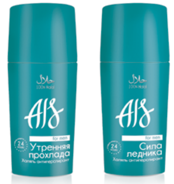
▼ Glacier Force AIS Halal Antiperspirant For Men 75 ml