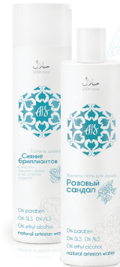
▲ AIS Gift Set for women • Diamond shining Shampoo • Rose Sandal Shower Gel 250 ml/250 ml