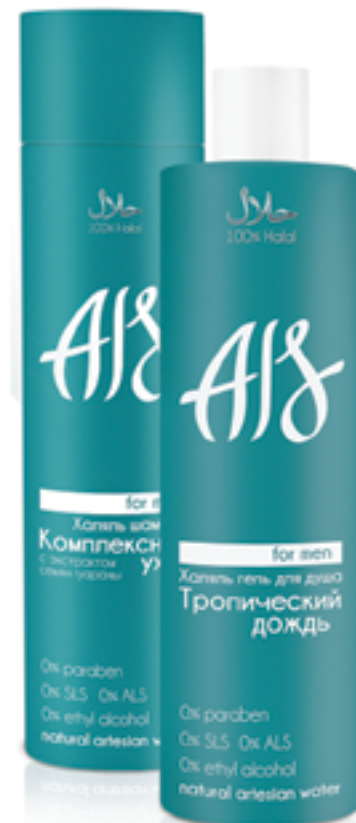
◀ AIS Gift Set for men • Complex Care Shampoo • Tropical Rain Shower Gel 250 ml/250 ml