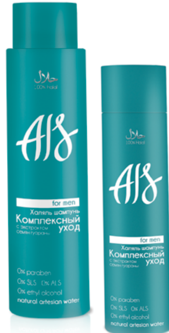
▲ Complex Care AIS Halal Shampoo With guarana seed extract 250/400 ml

AIS antiperspirants provide skin care and dryness for 12 hours. They contain bisabolol, an active component which effectively controls the smell and bacteria even during intensive physical activities.