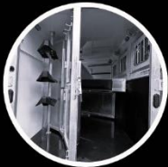
INTERIOR STALL CLEANING