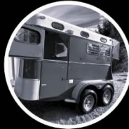
EXTERIOR WASH, WAX, AND POLISHING