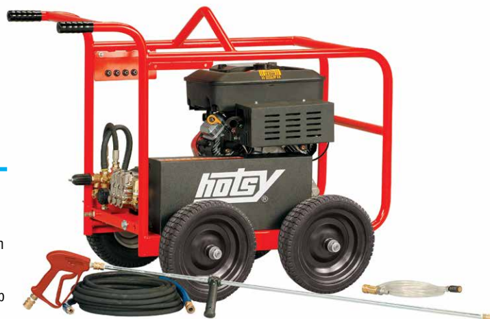
BD Series shown in large cage (4-wheel) version. Small cage 2-wheel version also available.

The BD Series is the most rugged cold water pressure washer on the market with its all-steel frame and cage, Hotsy belt-drive, triplex pump and cleaning power of up to 5000 PSI. Four gas models make up what is Hotsy's most durable cold water line-up ever. All models are ETL safety certified and feature the Hotsy pump backed by a full 7-year limited warranty. All models come equipped with a 50' high-pressure hose, lance, trigger gun, nozzles and chemical injector.