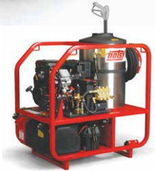
1080BE (shown with optional stainless steel coil wrap and skid rails)