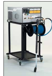
1700 Series shown with optional hose reel kit (PN 8.903-039.0) and Tall Floor Stand (PN 9.801-034.0).