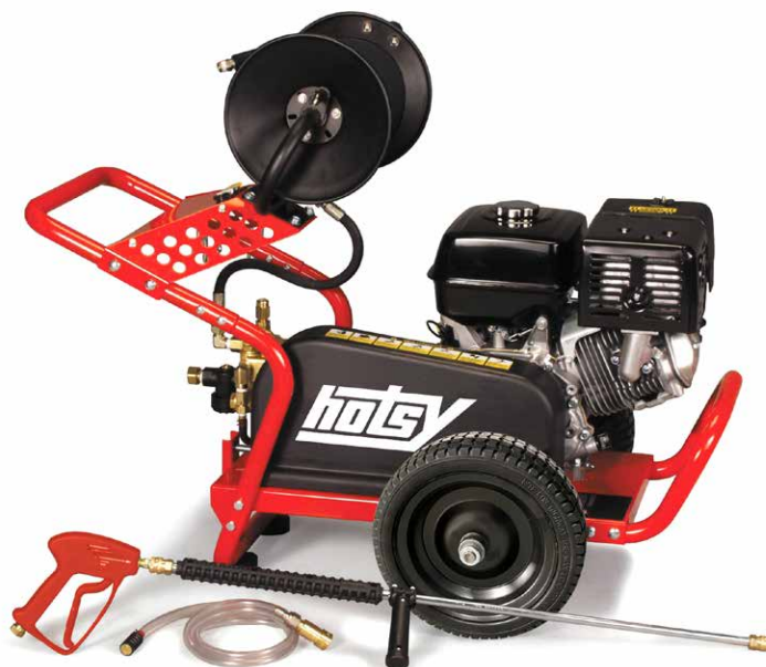
Shown with optional hose reel & mounting kit

The BX Series is similarly rugged to the BD Series, but more compact. Powered by Honda engines, the BX series delivers cleaning power up to 3500 PSI and an all-steel frame protected by a durable powder coat finish. All models are ETL safety certified and feature the Hotsy pump backed by a full 7-year limited warranty. All models come equipped with a 50' high-pressure hose, lance, nozzles and trigger gun.