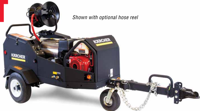
Shown with optional hose reel