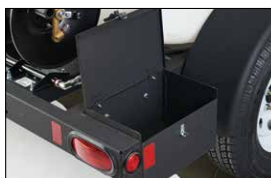
Side Saddle Tool Box