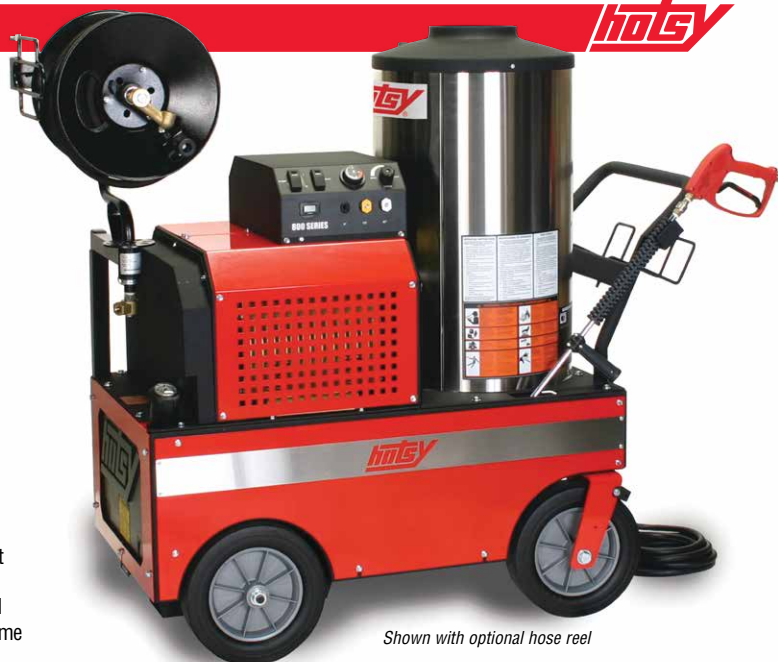
Shown with optional hose reel