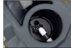
Reliable 120V Transfer Pump capable of transferring 30 GPM of water to the holding tank

Stop wash water from flowing down a drain or away from your area by collecting the wastewater from pressure washing. As EPA laws become more prevalent and strive to conserve water quality, contract cleaners and construction sites will need to recover their wash water and runoff. Eliminate the problem with the RC Series that is capable of recovering and transferring up to 30 GPM of water and transferring to a holding tank. Its small footprint allows the RC Series to be mounted on a trailer. Be fully in control of water flow with the optional water dikes and drain covers to stop water from flowing down a drain or away from your site. Comes standard with a 50' vacuum hose and scupper head.