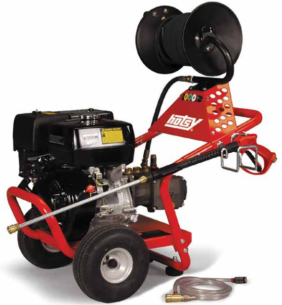
Shown with optional hose reel & mounting kit

The DB Series is the most compact, affordable alternative in the cold water line featuring a direct-drive triplex pump. All models are powered by reliable Honda engines. Lightweight design and tubed pneumatic tires make for easy maneuvering. All models are ETL safety certified and feature the Hotsy pump backed by a full 7-year limited warranty. All models come equipped with a 50' high-pressure hose, lance, trigger gun, nozzles and chemical injector.