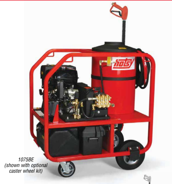
1075BE (shown with optional caster wheel kit)