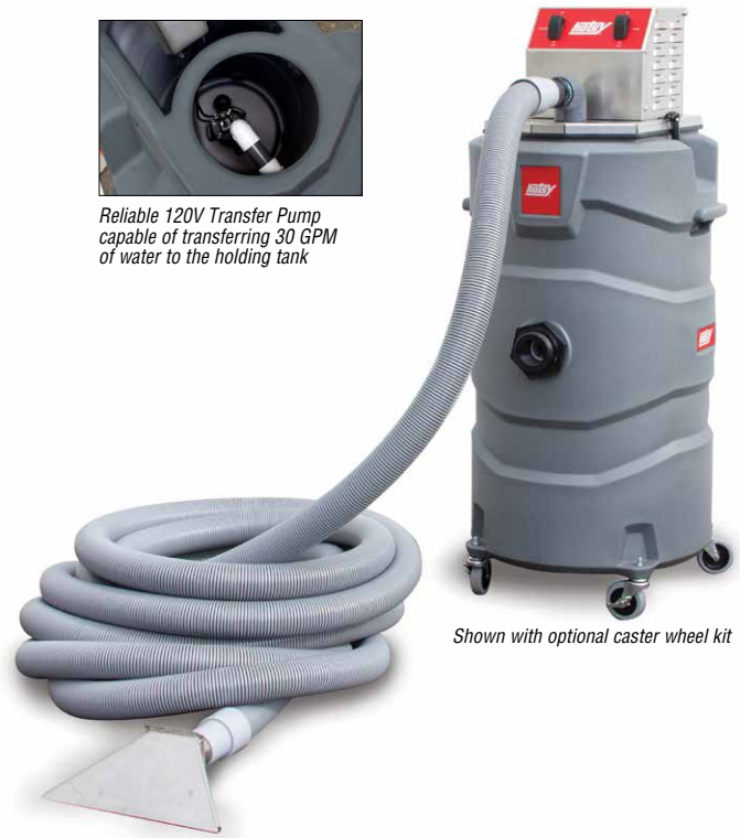
Shown with optional caster wheel kit