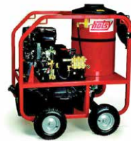
965B (shown with optional flat-free tires)