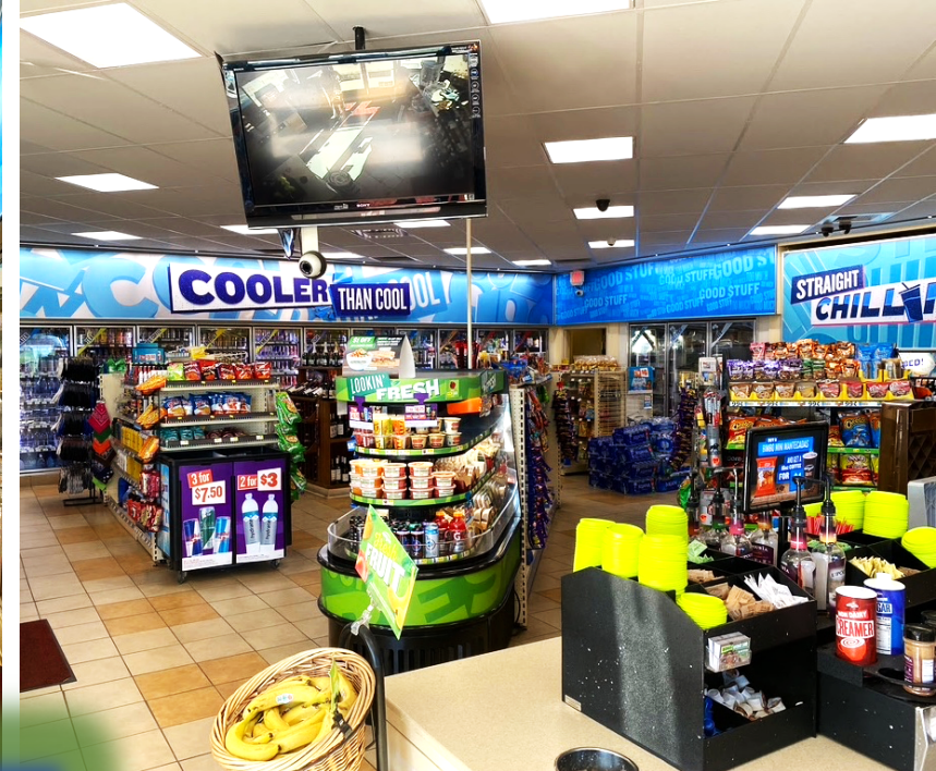
Beautiful, clean, and large c-store