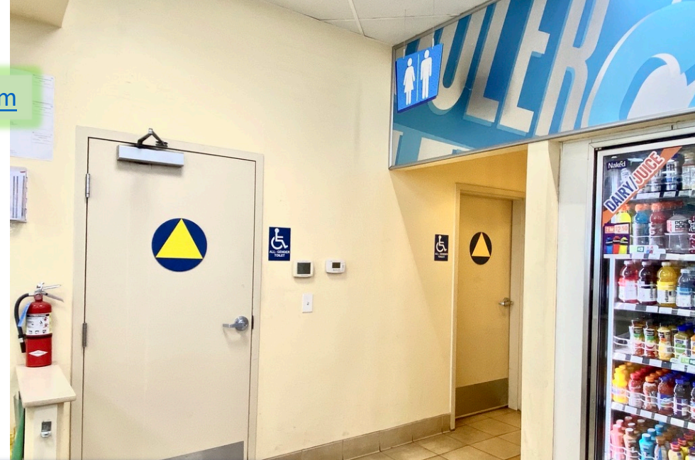
Two ADA compliance beautiful bathrooms