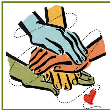
FELLOWSHIP IS A BLESSING

If that is not a tremendous cause for abiding joy, then what is?