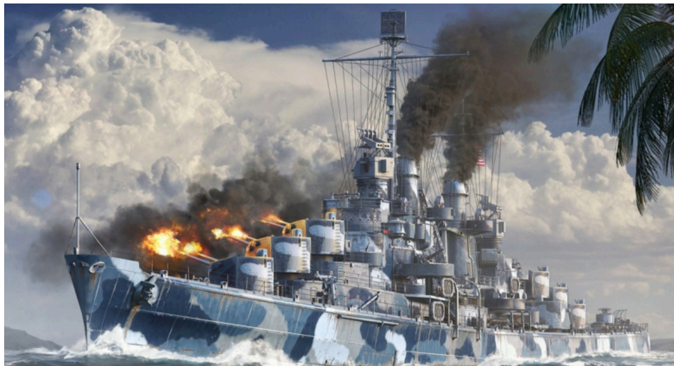
USS Atlanta (CL-51)