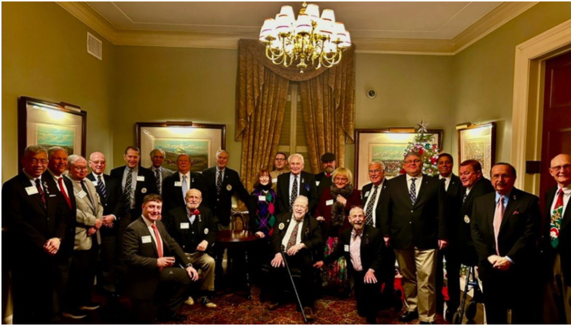
New York Commandery 2024