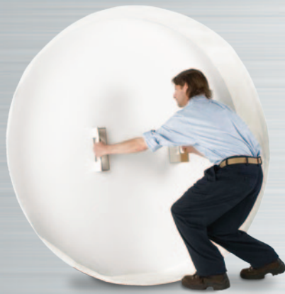
US & Foreign Patents Issued & Pending

EZ Purge® is a pre-formed, self-adhesive, water soluble purge dam that enables welders to save time on weld preparation as well as improve project timeliness. Since EZ Purge® is pre-formed; there is no need to measure, cut or construct a purge dam. Setup and installation time is completed in minutes, making EZ Purge® the most efficient and economical purge dam available.