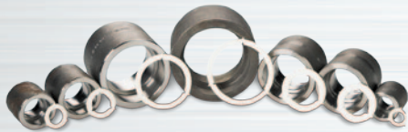
US & Foreign Patents Issued & Pending

SoluGap® Water Soluble Socket Weld Spacer Rings are made of EPA Approved Aquasol® Water Soluble Board. Dissolves completely and rapidly in most liquids. Unique tabs secure placement regardless of orientation. Compatible with any metal.