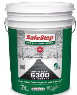
Also available in buckets