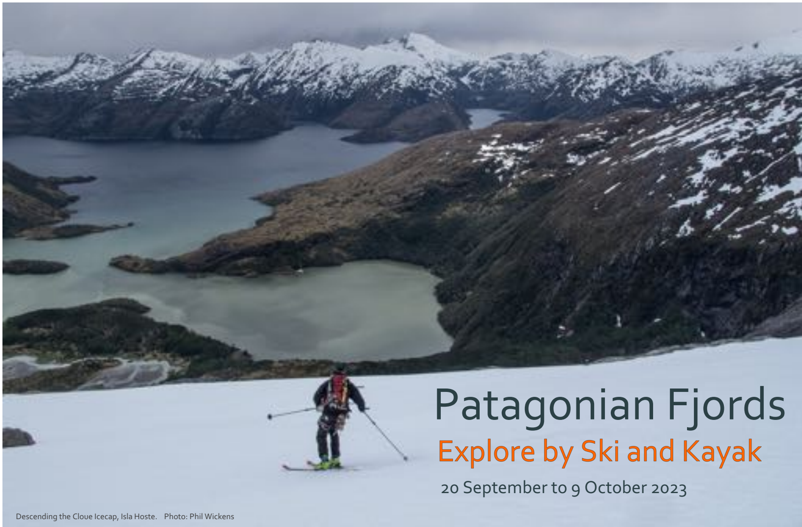
Descending the Cloué Icecap, Isla Hoste.