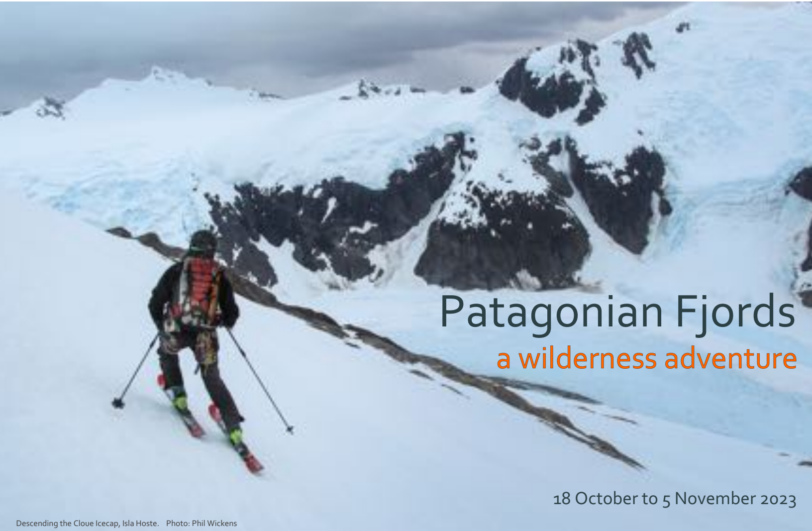
Descending the Cloue Icecap, Isla Hoste.