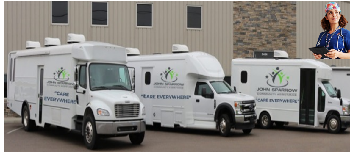
Mobile Health • Care Everywhere • Family Medicine Program

The programs explained herein are our current programs. New and current programs are established on an "on going" basis dependent on a specific location's needs.