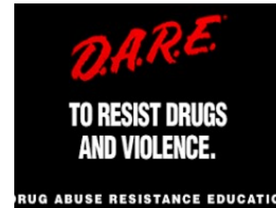
DRUG EDUCATION • SIMILAR IN CONTENT=