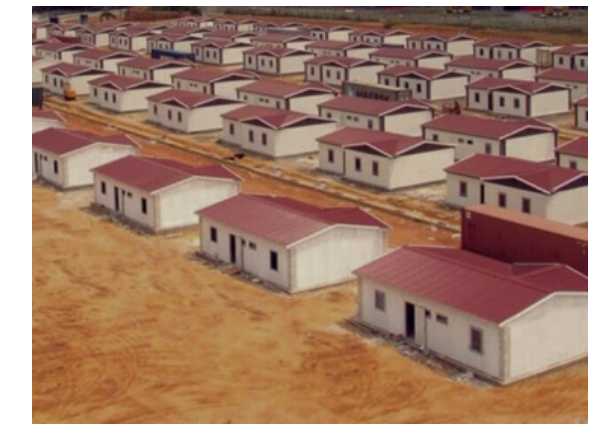
AFFORDABLE HOUSING / MORTGAGES