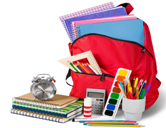
EDUCATOINAL SCHOOL SUPPLY GIVE-A-WAY KIT