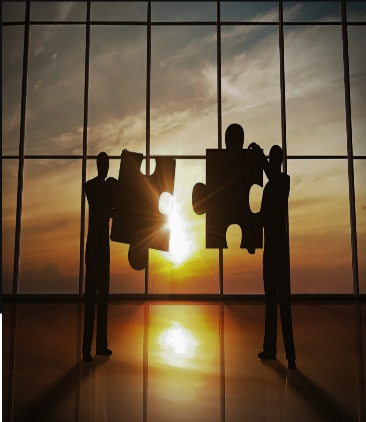
Photograph is for illustration purposes only