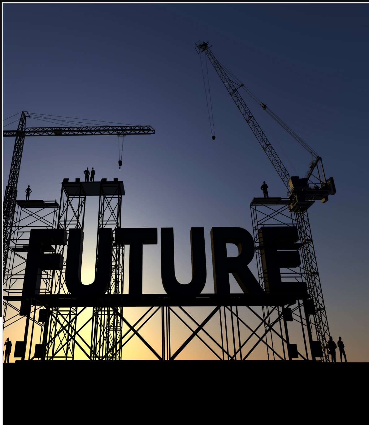
Photograph is for illustration purposes only