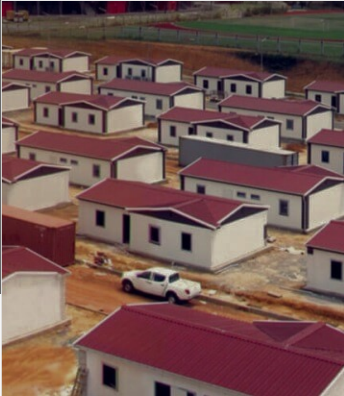
Photograph is for illustration purposes only