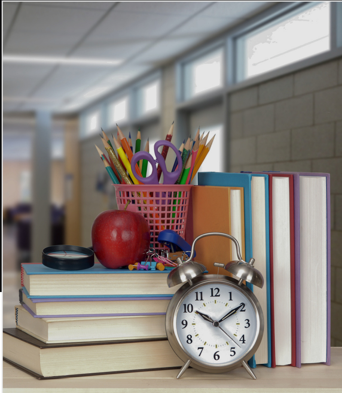
Photograph is for illustration purposes only