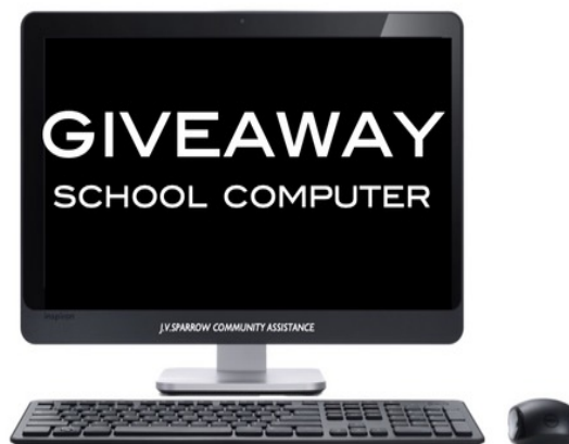
EDUCATIONAL • COMPUTER GIVE -A -WAY