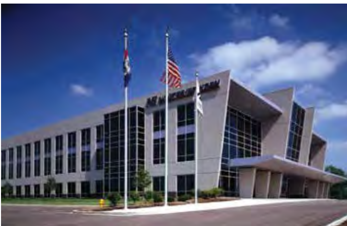
Nooter/Eriksen, Inc. USA (World headquarters)