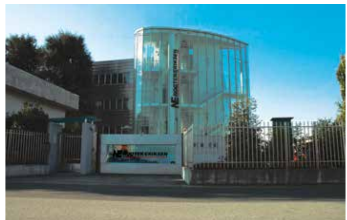
Nooter/Eriksen, SRL | Italy