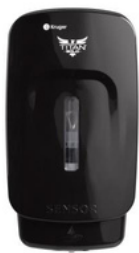
TITAN BOLD AUTOMATIC FOAM SOAP DISPENSER BLACK