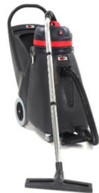
SHOVELNOSE WET DRY VACUUM W/24