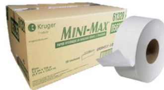
05625 Toilet Tissue Mini Max 2ply