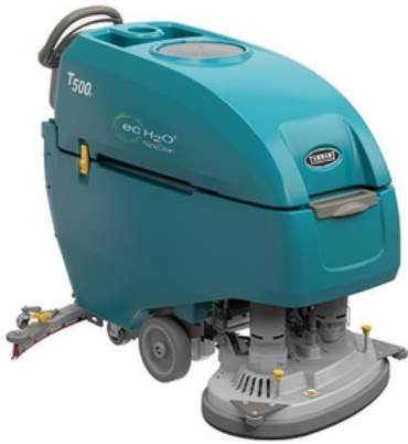
T500e Walk-Behind Floor Scrubber