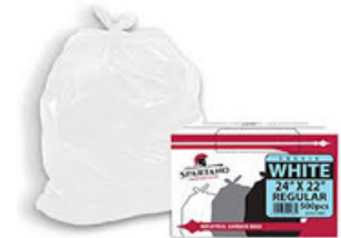
White Garbage Bags Of All Sizes