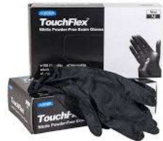
Nitrile Black Gloves 6.00 Mil - Powder Free