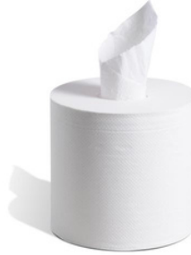
01320 EMBASSY 7.8X600 CENTER- PULL TOWEL 2-PLY 7.8X12