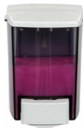
Bulk Soap Dispenser 30-oz P/S Black