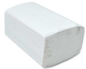
Single Fold Paper Towel, White, 16 Packs/Case, 250 Sheets/Pack