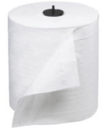
290095 TORK ADVANCED SOFT HAND ROLL TOWEL 1-PLY 7.7X900 WHITE