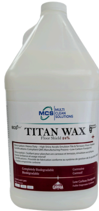
TITAN WAX Floor Shield 24% 4L (4/case)