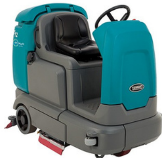
T12 Compact Battery Ride-On Floor Scrubber