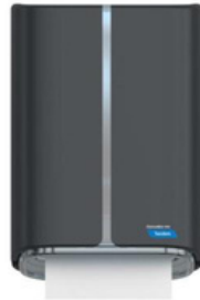
PRO TANDEM NO- TOUCH ROLL TOWEL DISPENSER