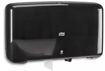
Tork® Mini Jumbo Bath Tissue Dispenser - Plastic, Double Roll