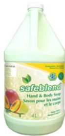
Safeblend Hand & Body Soap EcoLogo Certified Recyclable Mango Papaya 4L,