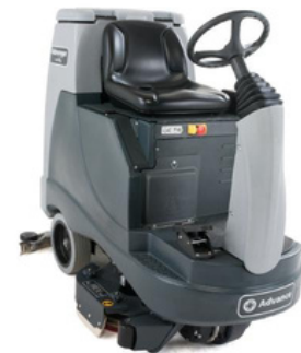
ADVANGER X2805R-C 310 OBC