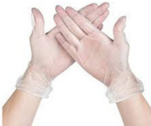
Vinyl Glove 3.0 Mil - Powder Free