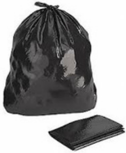
Black Garbage Bags Of All Sizes

Quality Supplies. Reliable Service. Everyday Value.