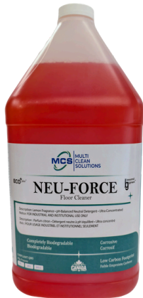
NEU-FORCE Floor Cleaner 4L (4/case)