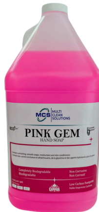
PINK GEM Hand Soap 4L (4/case)