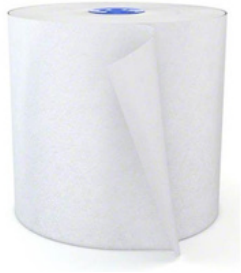
Cascades T116 White Tandem TAD Towel (6x775')