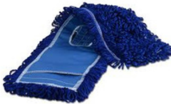
M2 Professional - 5" x 24" Blue Static-H Dust Mop Blue