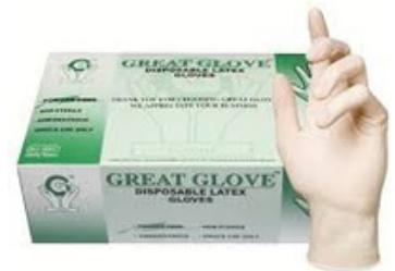
Latex Premium Gloves 6.00 Mil- Powder Free