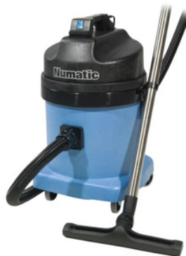
Numatic Nacecare CV570 Commercial Wet Dry Vacuum Cleaner