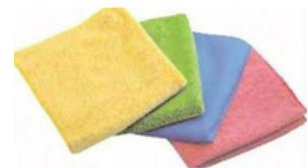
General Purpose Cleaning Cloths, 16" x 16", Microfiber