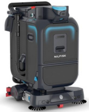
Robotic floor cleaning SC25 W 3D LIDAR