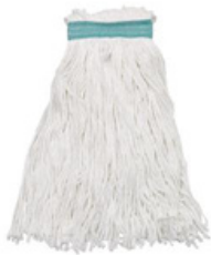
White Mop Head, Synthetic, 20oz