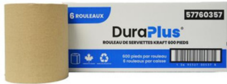
Hardwound Paper Towel, Kraft, 600', 6 Rolls/Case