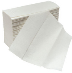
Cascades H170 Multifold Towel Select White