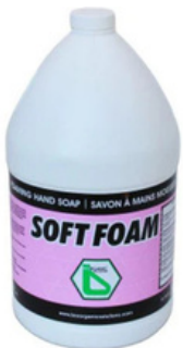
Soft Foam - 4 L Scented Foaming Hand Soap, 4Jg/Cs