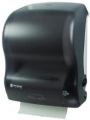
HANDS-FREE MECHANICAL ROLL TOWEL DISPENSER BLACK

Quality Supplies. Reliable Service. Everyday Value.