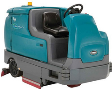
T17 Battery-Powered Ride-On Floor Scrubber