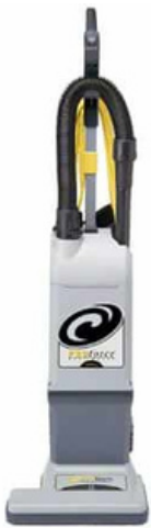
Proteam ProForce 1200XP Upright Vacuum