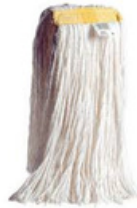
White Mop Head Synthetic, 24oz