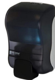
San Jamar® Foam Soap Dispenser, Manual, 28 oz