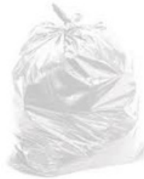
Clear Garbage Bags Of All Sizes