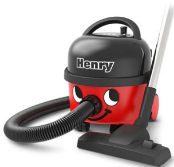
Numatic Henry Compact HVR160 vacuum cleaner