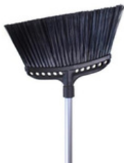
ANGLE BROOM PP 16" JUMBO BLACK/SILVER