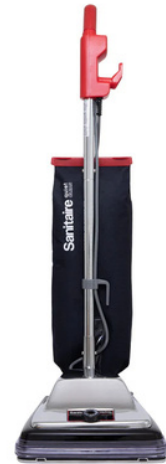
TRADITION® QuietClean® Upright Vacuum SC889D