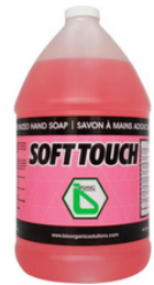
Soft Touch - 4 Liters Pink Lotonized Hand Soap, 4Jg/Cs