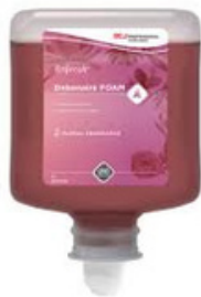
Refresh Debonaire, oaming Hand Soap, 1 Liter/Bottle