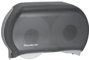
Cascades - Double JRT Toilet Tissue Dispenser