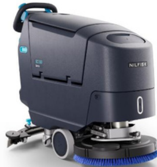
Nilfisk SC550 D 20 LI-ION US