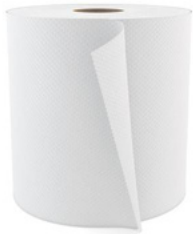
Cascades® Paper Paper Towel, White, 8" X 800', 2" Core, 6 Rolls/Case