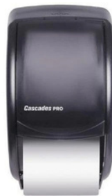
Cascades - Universal Standard Toilet Tissue Dispenser