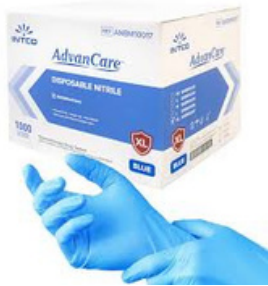
Nitrile Blue Gloves 4.00 Mil Powder Free

Quality Supplies. Reliable Service. Everyday Value.