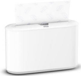
Tork Xpress multifold countertop hand towel dispenser white