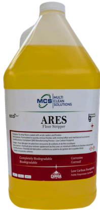
ARES Floor Stripper 4L (4/case)

Quality Supplies. Reliable Service. Everyday Value.