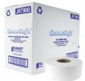
Snowsoft Toilet Tissue 2-Ply Jumbo Roll White