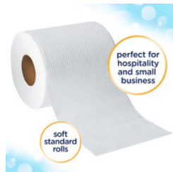
Cottonelle 2ply Toilet Tissue (60x451 sheet)