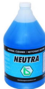
Neutra - 4 L Neutral Cleaner, 4Jg/Cs