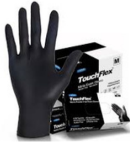
Nitrile Black Gloves Touch Flex 5.0 Mil - Powder Free