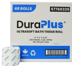
DuraPlus® Bathroom Tissue, 2-Ply, White, 48 Rolls/Case, 420 Sheets/Roll