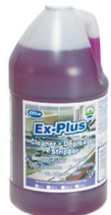
EX-PLUS ALL PURPOSE CLEANER/DEGREASER – 3.78 L (4/case)