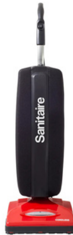
QUICKBOOST™ Cordless Upright Vacuum SC7500A