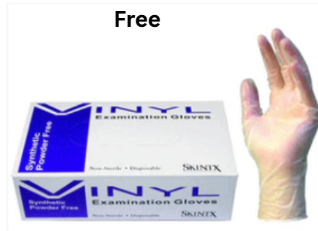
Vinyl Gloves 4.00 Mil- Powder Free