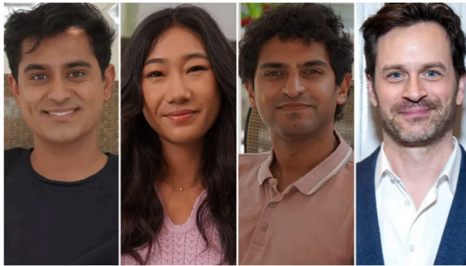
(L-R) Kapil Talwalkar, Olivia Liang, Karan Soni and Tom Everett Scott