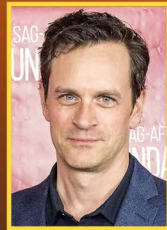
Tom Everett Scott