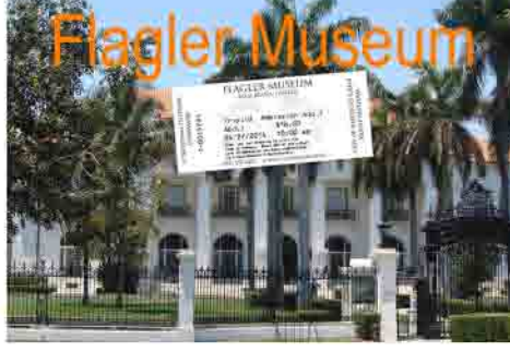
Flagler Museum April 27