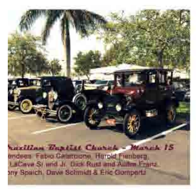
ian Church Show Mar 15