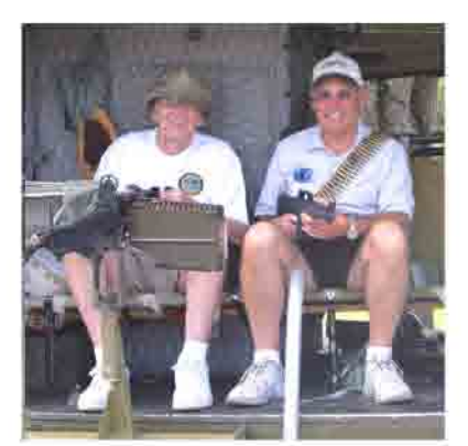
Military Show Sept. 14