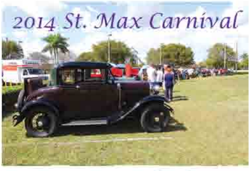
St. Max Carnival Feb.22