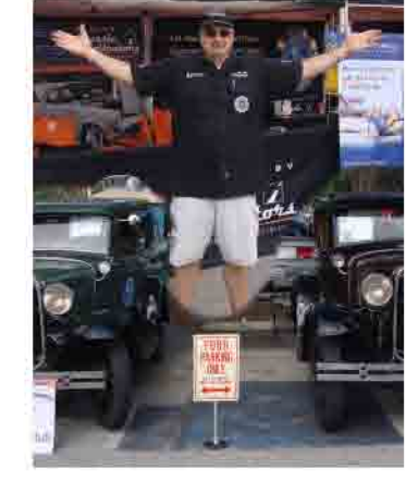
Festival Show Mar. 30