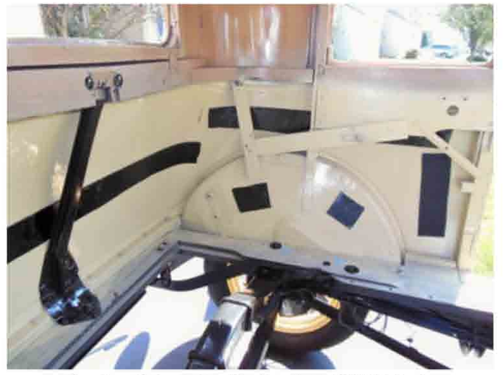
Roofing Shingle Application In A 190A Victoria

The exhaust system muffler is below the horizontal front wood floorboard, so it's a good idea to do something about heat radiating from the muffler. There is a muffler heat shield available from Model A parts suppliers, but you can augment the shield to further reduce heat radiation through the floor. A simple solution is to cover the bottom of the floorboard on the passenger's side with bare aluminum sheet metal you can buy from the big box home improvement stores. Get the thinnest sheet metal available, and attach it to the floor board with construction adhesive. Also use brads or staples along the perimeter of the sheet metal. Leave the sheet metal bare (unpainted) so it behaves as a reflector.