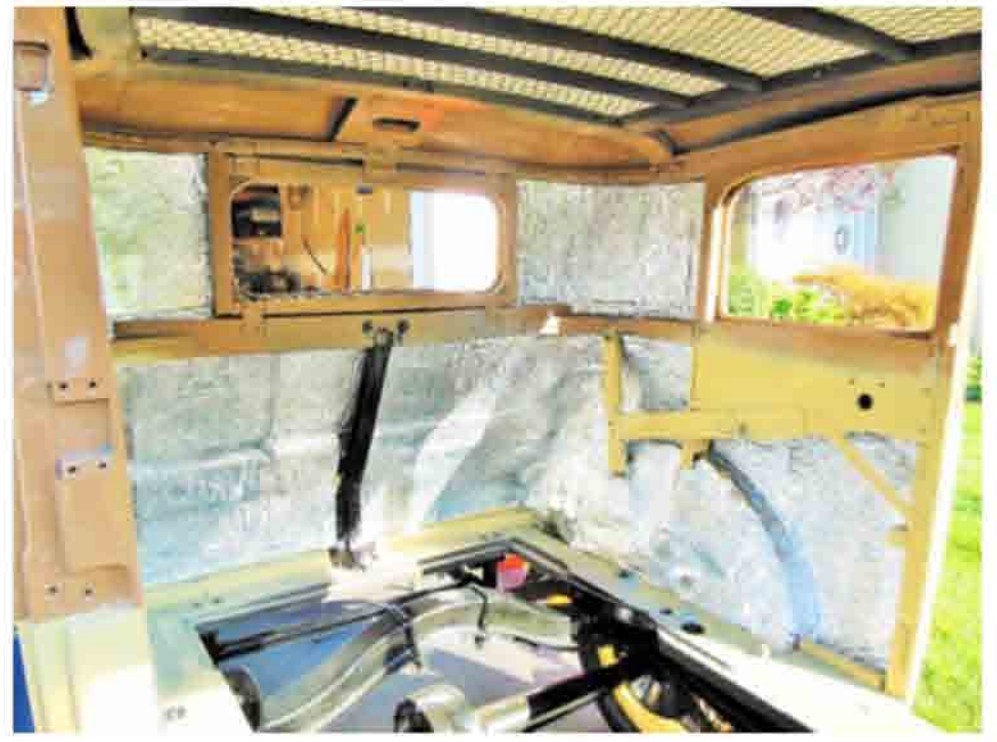
FV516 Foil Application