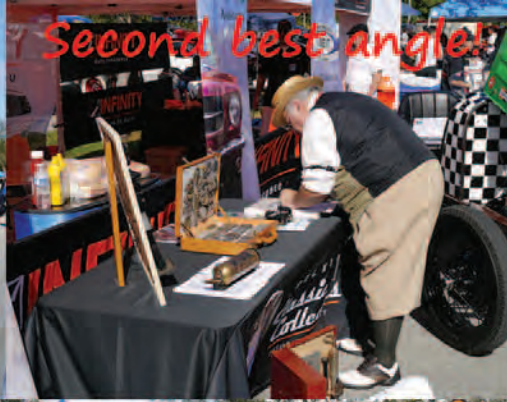
Second best angle!