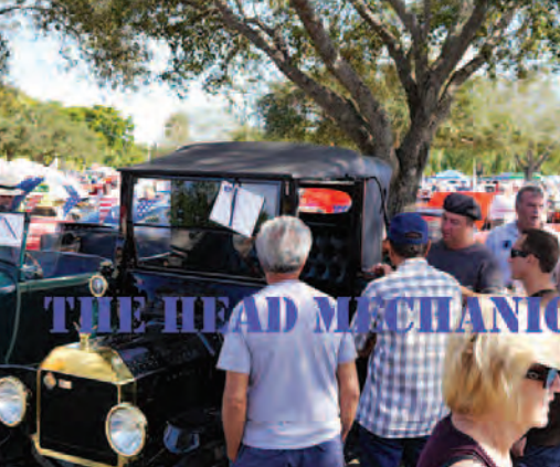
THE HEAD MECHANIC