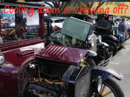
Cooling down or showing off?