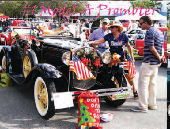
#1 Model & Promoter