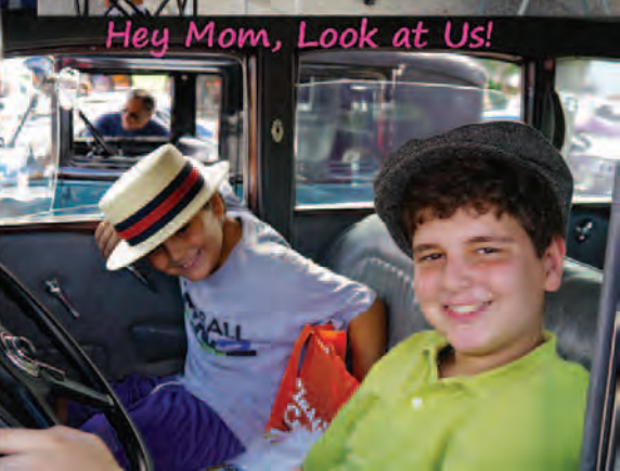
Hey Mom, Look at Us!