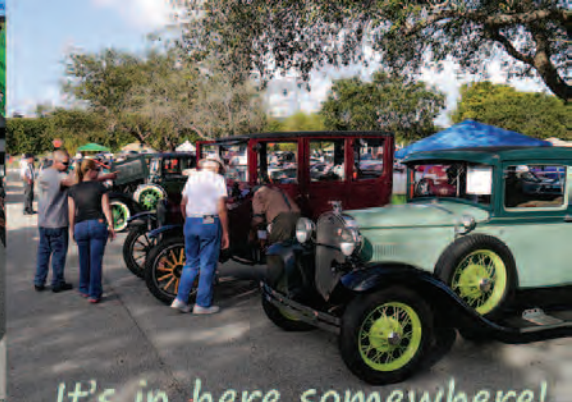
It's in here somewhere!