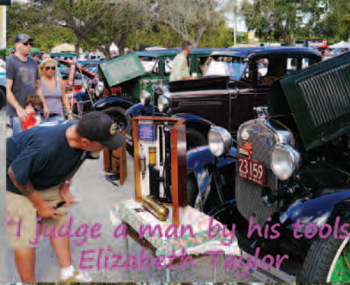
"I judge a man by his tools" Elizabeth Taylor