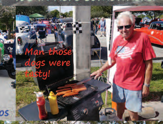
Man those dogs were tasty!