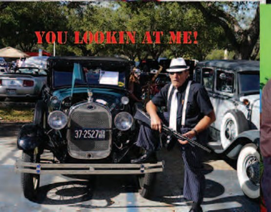
YOU LOOKIN AT ME!