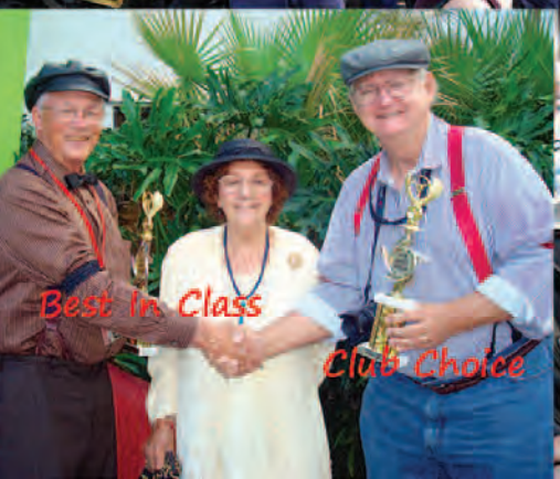
Best in Class