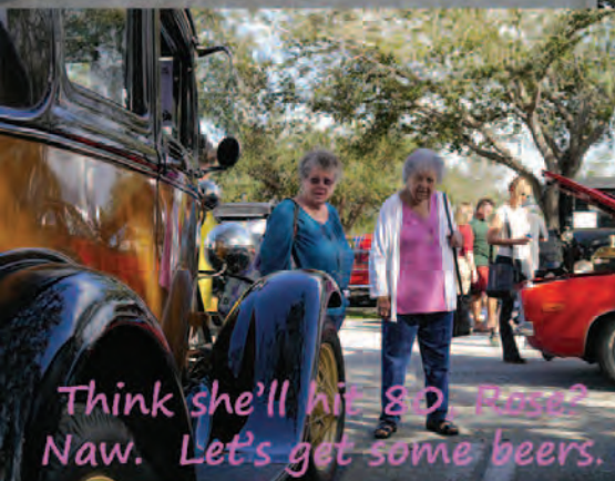
Think she'll hit 80 Rose? Naw. Let's get some beers.